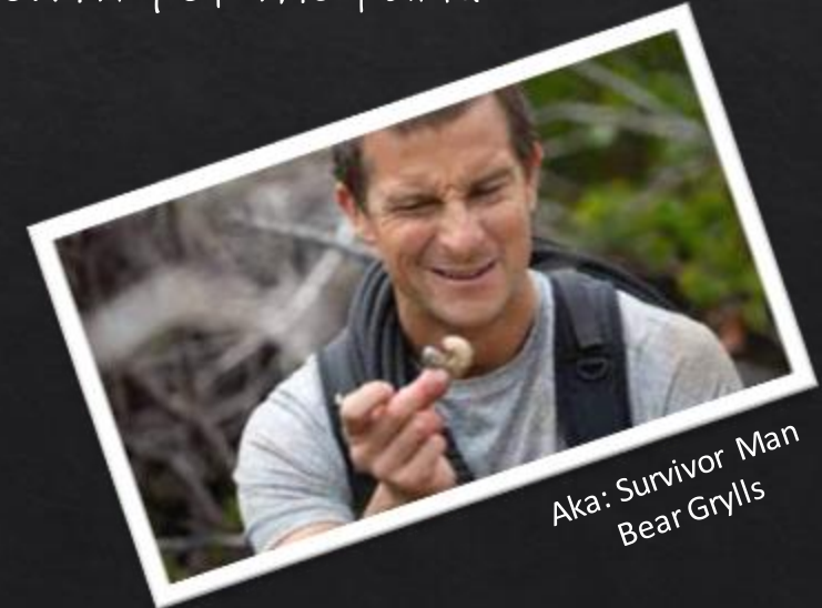
Aka: Survivor Man Bear Grylls