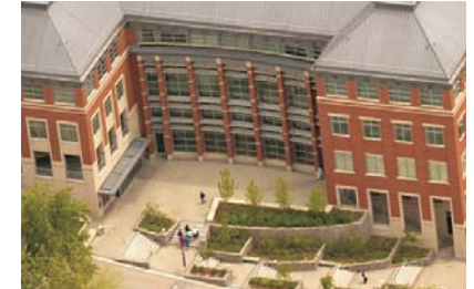
Smith Center for Undergraduate Education (CUE)