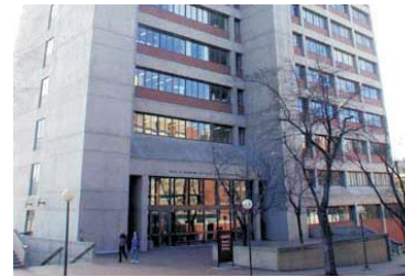
Webster Physical Sciences