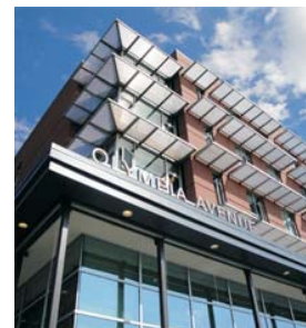
Olympia Avenue Residence Hall