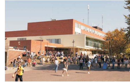
Compton Union Building (CUB)