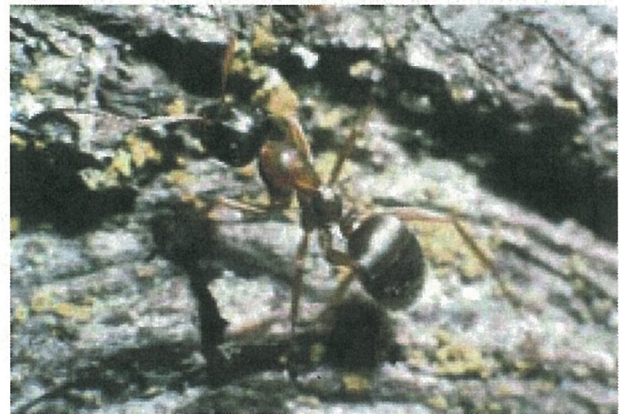
Fig. 2. Formica neoclara —a thatching ant.