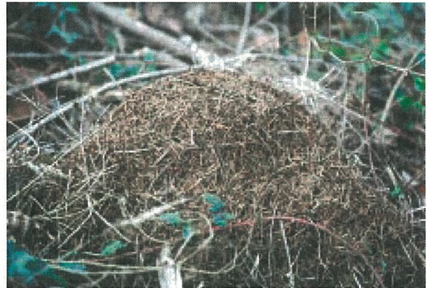
Fig. 1. Thatching ant mound.

Thatching ants can be confused with carpenter ants. A sure way to distinguish them from carpenter ants is to view them from the side and determine if the thoracic dorsum is smoothly rounded. All carpenter ants have this rounded thoracic dorsum (Fig. 3). Thatching ants have a notch or dip on the thoracic dorsum (Fig. 4). This diagnostic tool works only when comparing workers of either species.