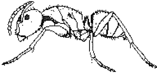
Fig. 3. Carpenter ant ( Camponotus spp.)