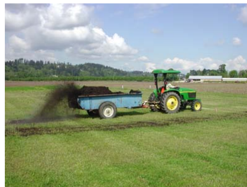
Figure 3. Calibrate your manure spreader so you have a good idea of how much manure you are applying.

idea of how much manure you are applying. The principle of calibrating a manure spreader is the same as calibrating a fertilizer spreader, a planter, or a sprayer. The simplest method is to spread tarps on the ground and weigh the amount of manure that falls on each tarp as the spreader passes over it. If you have access to truck scales, you can weigh a full spreader, apply a load to your field, weigh the spreader again, and measure how much land you covered (Figure 3). You can also estimate volume spread by calculating the volume of your spreader. For details and simple worksheets on calibration, see “Fertilizing with Manure,” available from Washington State University Extension.