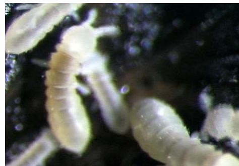
Figure 1. Tiny soil organisms that help break down organic matter.

Fresh manure breaks down faster than composted manure. Poultry manure breaks down faster than manure from horses, cattle, goats, and other animals. In general, the more nitrogen that manure contains the quicker the nitrogen is released.