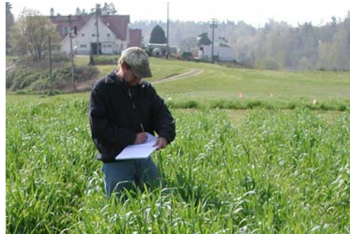
Figure 4. A rye cover crop protects a field fertilized with manure.

A fall-planted cover crop such as rye protects the soil and prevents manure runoff during the winter.