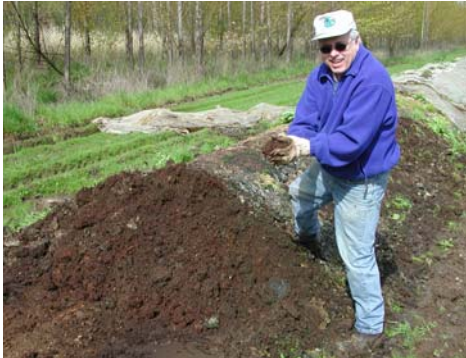
Figure 6. Well-composted manure is dark and crumbly.

a fertilizer and horse manure as a mulch or soil amendment.