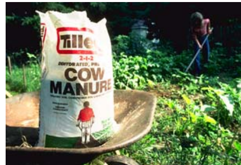
Figure 5. Many home gardeners like to use cow manure to enrich their soil.

too bulky for farmers to buy, but gardeners often seek them to enrich their soil (Figure 5). Many gardeners are eager to buy or take manure from local farms.