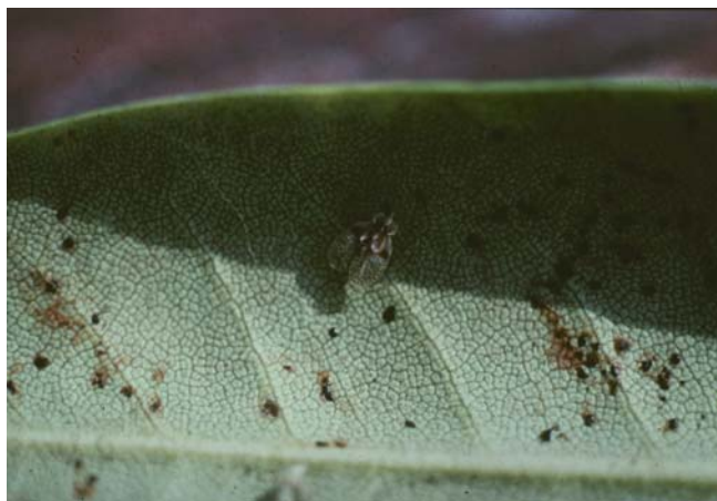
Fig. 3. Fecal material stuck to the leaf (Note: lace-bug in the center)