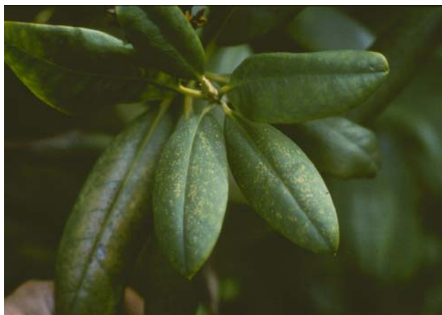
Fig. 2. Stippling of Rhododendron leaves