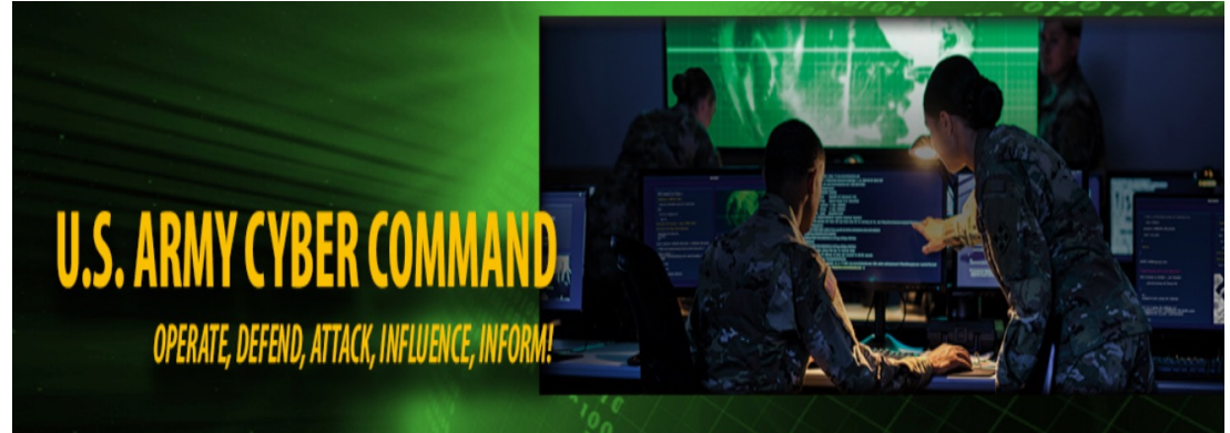
👉 The Nation's Army in Cyberspace