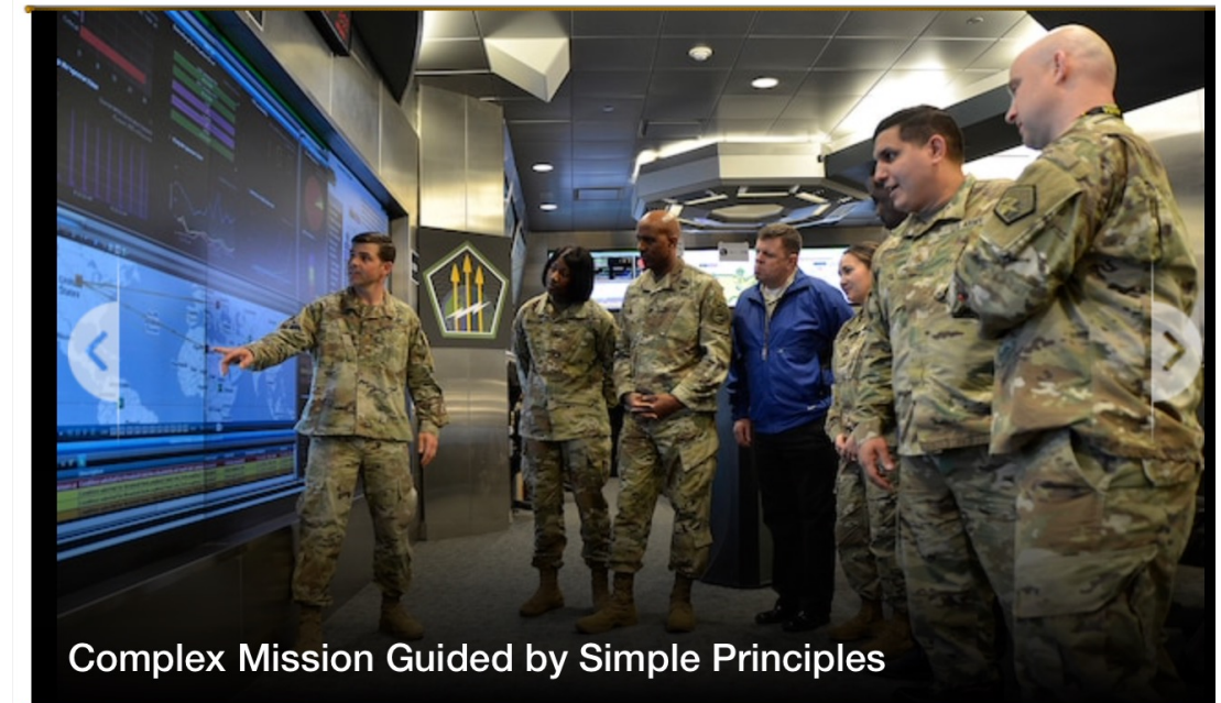
Complex Mission Guided by Simple Principles