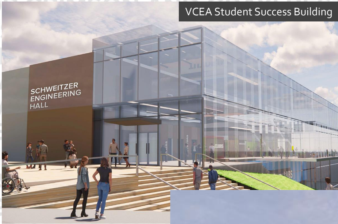
VCEA Student Success Building