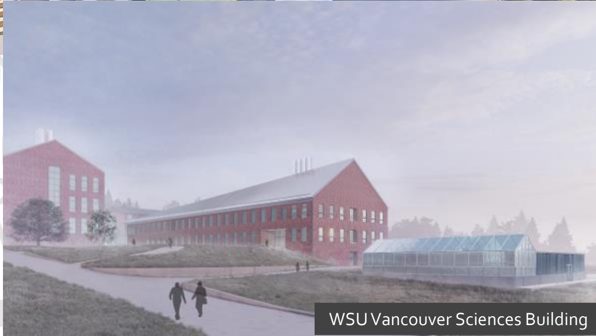
WSU Vancouver Sciences Building