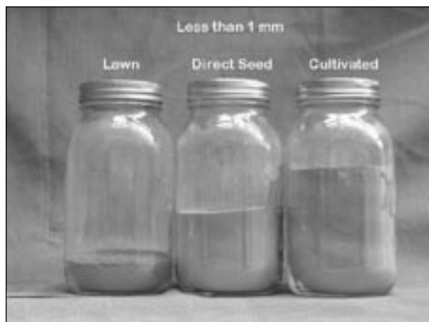
FIGURE 7.1. Quantity of Shano silt loam soil from an original one-quart volume that passed through a 1 mm (0.040 in) mesh sieve. The soils left to right were obtained in June 2002 from a 1) grass lawn (lawn), 2) dryland plot after four years of continuous no-till (direct seed), and 3) field of intensively tilled fallow (cultivated), all from the WSU Dryland Research Station at Lind, WA. The fine soil represents the mass that is readily subject to blowing if it was not protected with soil surface cover or soil surface random roughness. Accordingly, nearly 70% of the tilled fallow soil, 45% of the no-till, and 15% of the lawn soil would be fine enough to blow if exposed to strong winds.

evolution during incubation. Non-labeled wheat straw was added to soils from the SWWW-MTF and continuous HRSW treatment plots at different times during incubation to compare effects of soil disturbance only, or disturbance plus additions of wheat straw to determine whether a “priming effect” might enhance the decomposition of soil organic matter.