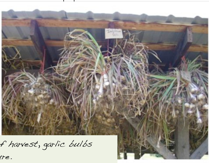
After the hard work of harvest, garlic bulbs hang in the shed to cure.

bowl of a food processor, and pulse until well blended. Spread the onions liberally with the butter. Return them to the oven to cook until the butter just melts about 2 minutes. Sprinkle with grated cheese and reserved tablespoon of pine nuts. Serve alone or over sautéed chard or other greens.