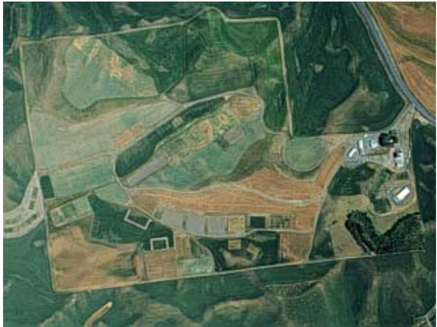
Aerial view of the Palouse Conservation Farm

Several persons are employed at the Station by both the federal and state cooperators. The Station has a full-time manager who lives on-site and maintains the busy flow of activities which characterize the farm. This includes the day-to-day routine items, farm upkeep, maintaining the complex planting and harvest schedule to meet the requirements of the various cropping research, and operating the machine shop