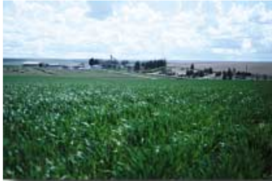
Buildings and grounds of the WSU Dryland Research Station at Lind.

The Washington State University Dryland Research Station was created in 1915 to "promote the betterment of dryland farming" in the 8-to 12-inch rainfall area of eastern Washington. Adams County deeded 320 acres to WSU for this purpose. The Lind station has the lowest rainfall of any state or federal facility devoted to dryland research in the United States.