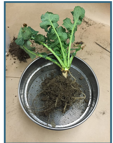
The term “rhizosphere soil” refers to soil that adheres to the roots of plants as seen here with winter canola.

In the spring of 2019 (and planned again for 2020), we sampled bulk and rhizosphere soils of actively-growing spring wheat following canola, winter wheat and winter triticale. DNA will be extracted from the samples and sequenced with Illumina MiSeq. We will analyze the bacterial and fungal communities to identify differences among the three rotations. This will complement the phospholipid fatty