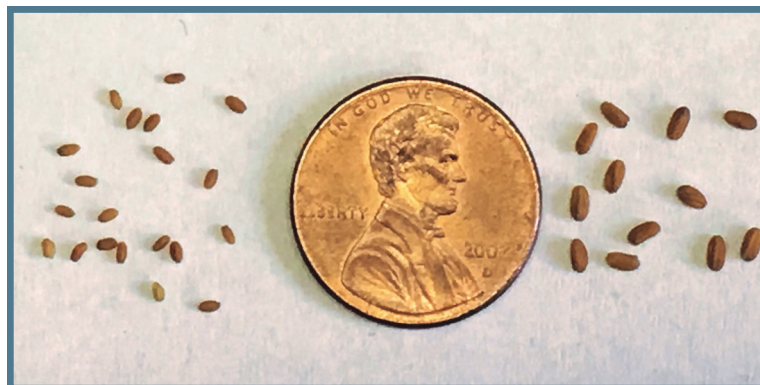
Variation in seed size in different Camelina breeding lines.

A second breeding objective is a variety that will be more widely accepted for edible oil purposes. Although this market is already expanding, camelina oil has not been approved by the FDA partly due to the erucic acid content. Current camelina varieties have erucic acid contents of approximately 3% while canola and other oils are less than 1%. Our cooperator at Montana State University, Dr. Chaofu Lu, has identified a mutation causing low (~0.5%) erucic acid. This trait is being bred into our highest performing lines for release as a low-erucic, herbicide tolerant variety for cooking/salad oil.