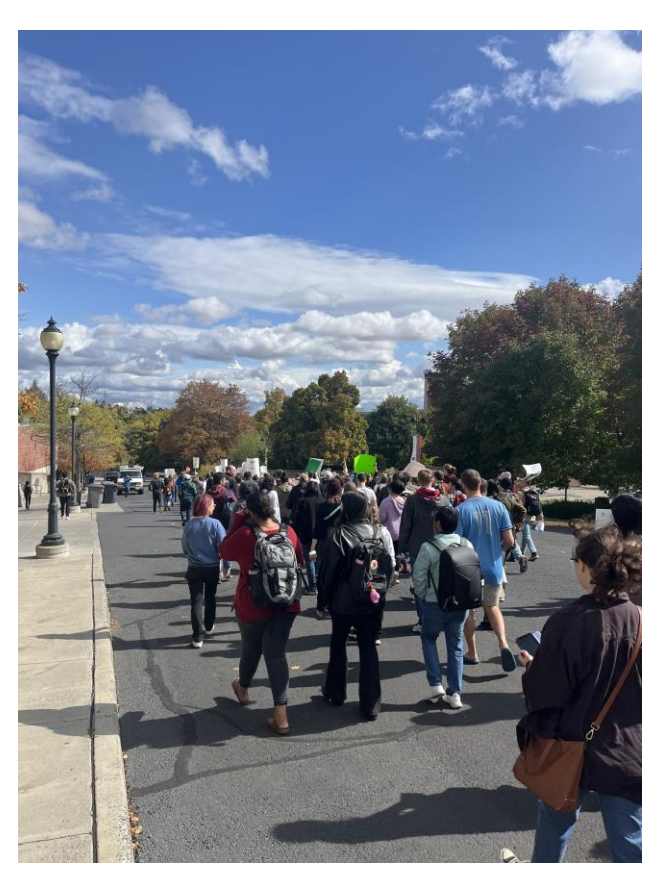
1 - Students marching from the Terrell Mall to the French Admin building

A photo of our students was featured on the Daily Evergreen for the Rally: <a href="https://dailyevergreen.com/166152/news/student-employee-union-files-unfair-labor-lawsuit-against-wsu/">https://dailyevergreen.com/166152/news/student-employee-union-files-unfair-labor-lawsuit-against-wsu/</a>