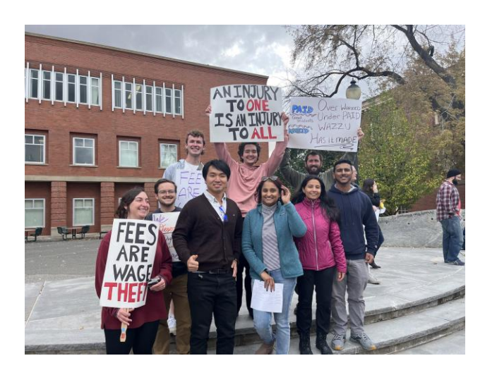
2 - A portion of the Pullman folks that showed up to the rally!