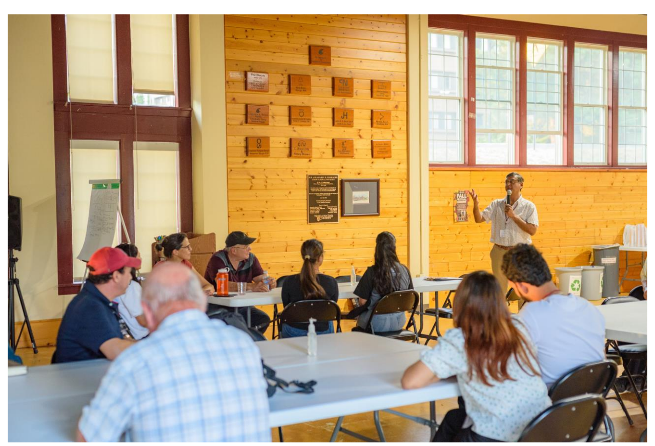
Please contact the corresponding person for more details!