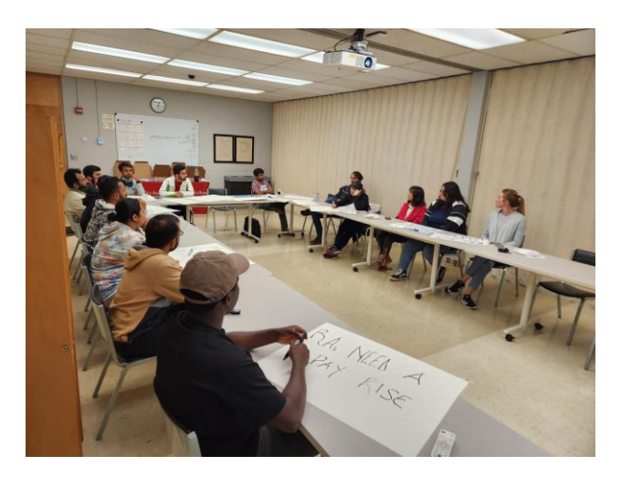
4 - ASEs in Prosser discussing what improvements they want to see.