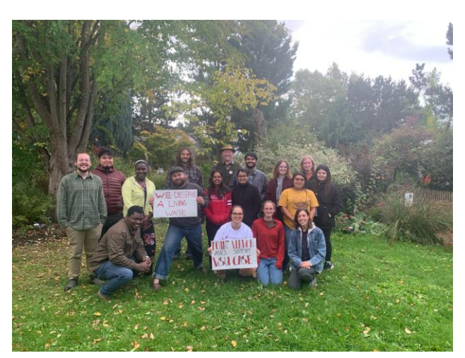
3 - ASEs in Mount Vernon at the NWREC