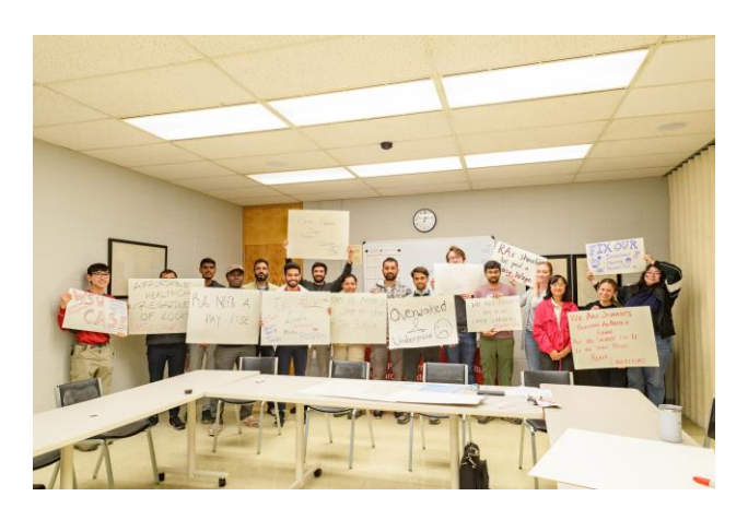
5 - Prosser ASEs at IAREC with their signs