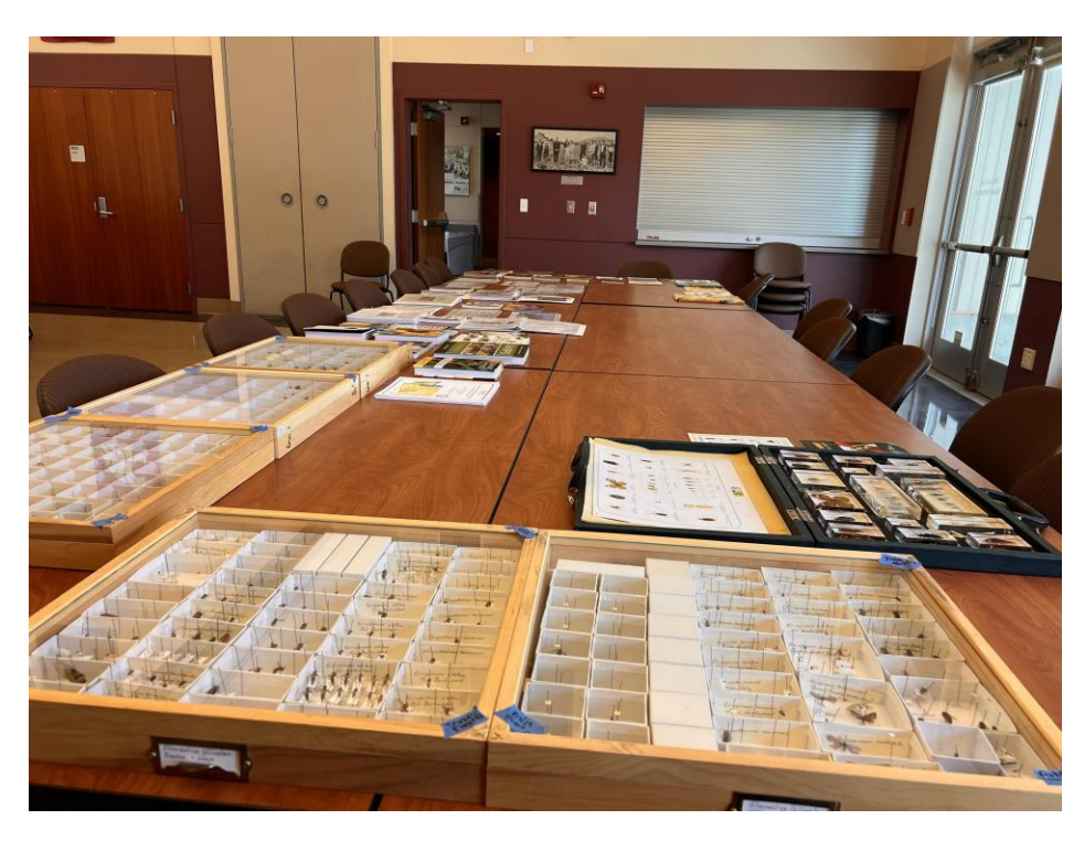
21 - Bob Gillespie's pollinator collection display.