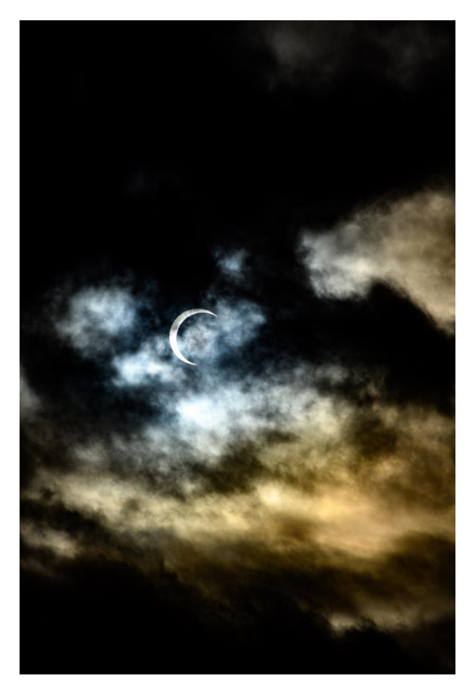
23 - Partial Annular Eclipse seen from the Horse Heaven Hills

The irrigation is being turned off and things are slowing down. The roof of Hamilton Hall is getting some much needed maintenance before the winter hits!