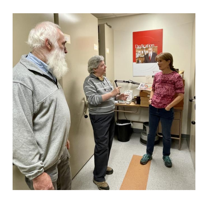
Events in Pullman and REC Locations