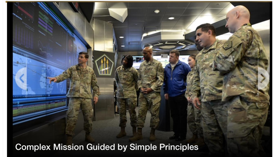
Complex Mission Guided by Simple Principles