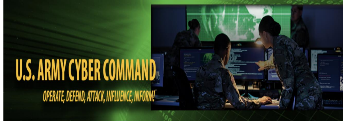
The Nation's Army in Cyberspace