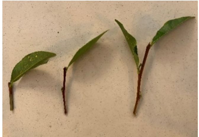
Fig. 4. Single-node, two-node, and three-node tea cuttings.