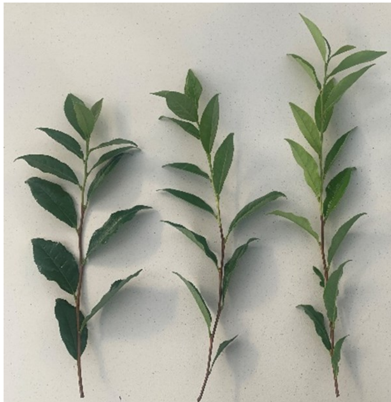
Fig. 2. Recently matured tea shoots for propagation, showing slightly reddened bark.