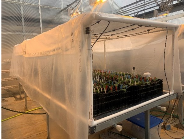
Fig. 1. A sample mist chamber (14 ft long x 5 ft wide x 3 ft tall).