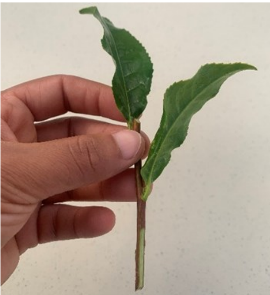
Fig. 5. Scoring of tea cuttings.