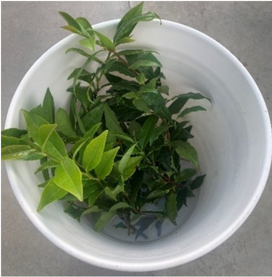
Fig. 3. Tea shoots placed in water before processing.