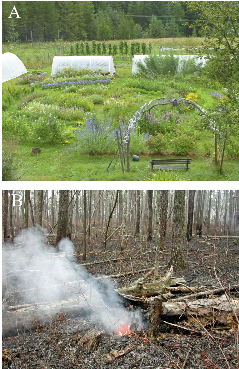
PLATE 1. The adoption of organic farming practices in agricultural systems and controlled burns in natural plant communities are two common land-management schemes thought to benefit biodiversity. Shown are (A) an organic farm in Sandpoint, Idaho, USA, and (B) a controlled burn in the Kisatchie National Forest, Louisiana, USA.

2006, Hillebrand et al. 2008). Experiments that separately manipulate richness from evenness, and vice versa, could provide a particularly powerful way to uncover the contribution of each biodiversity facet to ecosystem health and food-web interactions (e.g., Isbell et al. 2009, Wittebolle et al. 2009).