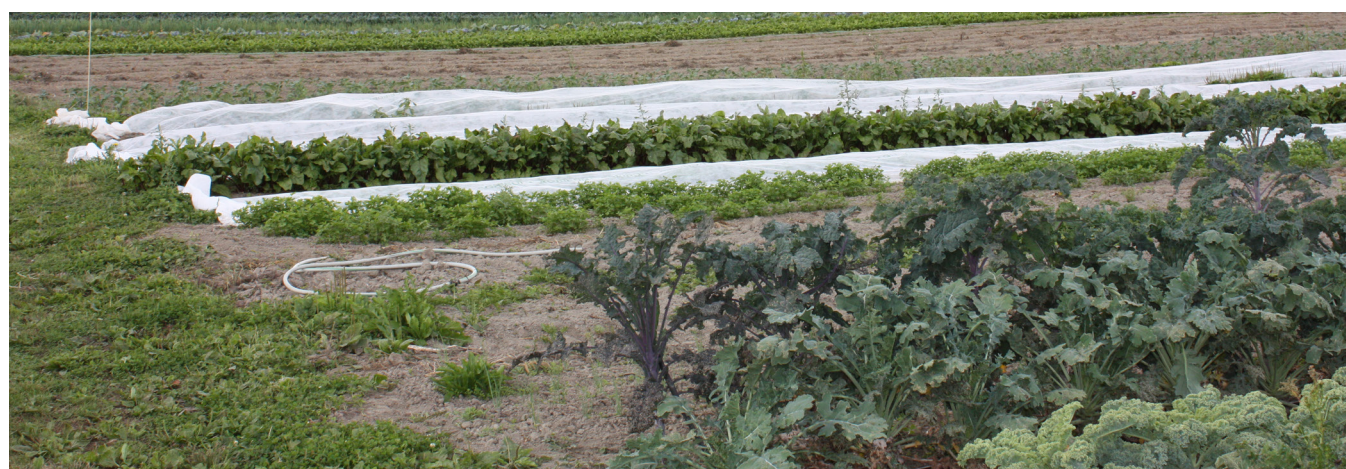
Figure 38. Diversified vegetable farmscape common in western Washington.