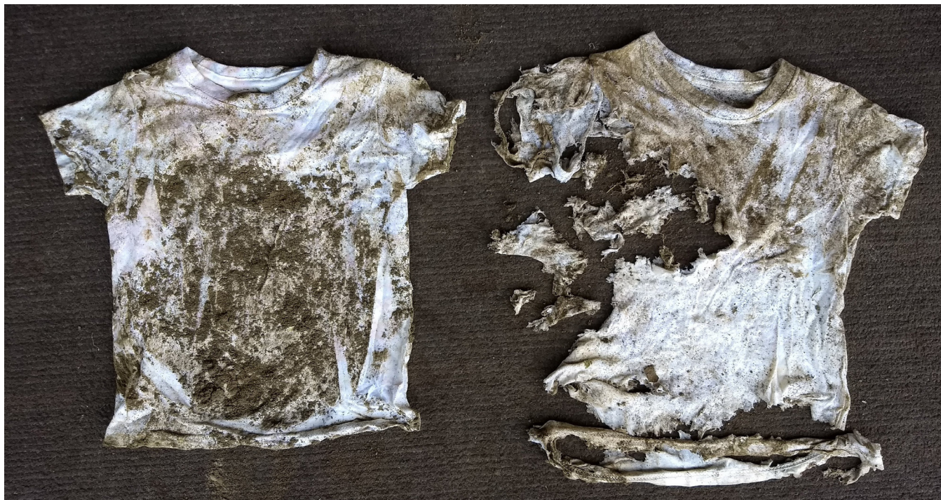
Figure 30. Results after two cotton t-shirts were buried in a regularly tilled field (left) and a field that had not received tillage for eight years (right). Higher soil microbial activity broke down the t-shirt on the right more quickly.

also recognize that soil organic matter and soil biology play a role in helping to reduce issues with compaction and water management and are working to find ways to increase organic matter inputs to the soil.