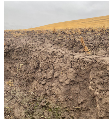
Figure 1. Ditch erosion in the Palouse region.

Water erosion is a serious issue in areas such as the hilly Palouse region with soil losses of 10 to 30 tons per acre per year. This issue is largely caused by exposed soil during precipitation events, and its importance varies by production system and geographic region. Wind erosion is a significant issue in parts of eastern Washington's Columbia Basin. In some cases, there's enough blowing soil to close roadways due to lack of visibility. More important for producers is the loss of topsoil and damage to young plants that can result from windstorms. Soil health practices that promote soil cover or stabilize soil, such as high residue farming, tillage reduction, or incorporation of green manures can reduce wind erosion (McGuire 2011).