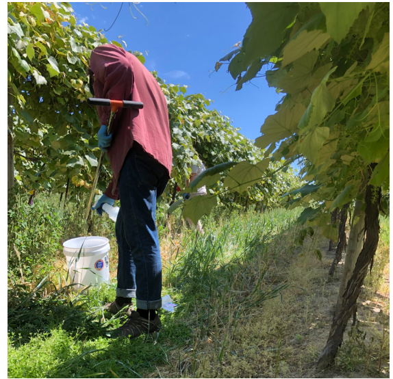
Figure 24. Researchers soil sampling to evaluate soil health in vineyards

The term 'soil health' can vary in meaning to many in the grape industry. Historically, soil research and priorities have focused on nutrient management/deficiencies, soil structure and irrigation, and terroir as it relates to a specific AVA. The industry has funded decades of research on nutrient management and Concord foliar chlorosis as well as irrigation practices and their effects on vine vigor and grape quality. Other major soil issues include nematodes, phylloxera, and replant disease. Recently in Concord grapes, the industry has explored functional microbe ecology to improve nutrient uptake, but that work is not yet conclusive. Despite the long-term reliance on irrigation in this arid climate, including the use of deficit irrigation for wine grapes since the mid-1990s, salinity is not yet considered a concern among industry members.