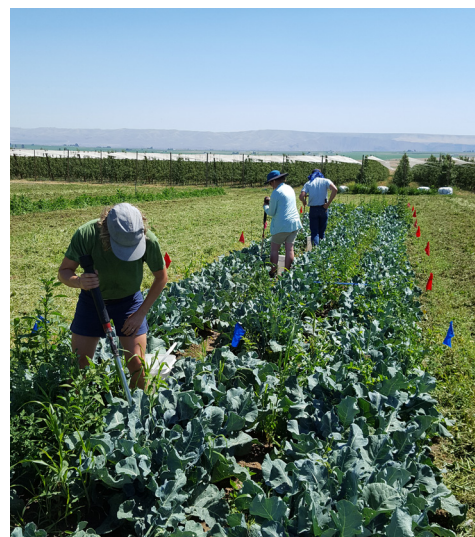
Figure 35. Researchers gather soil samples in organic fertilizer trial.

Tillage is used to prepare ground for planting and is an important method of weed suppression in organic production. However, tillage can lead to a loss of organic matter and is detrimental to soil microbial populations. Reducing tillage is challenging in organic systems, especially for annual vegetable production as tillage is also typically used to prepare ground for, terminate, and incorporate cover crops. Participants observed an increase of wireworm and symphylans when tillage is reduced. Producers see obvious trade-offs between production and reducing tillage. For example, one participant mentioned using precision direct seeders, which can improve stands and reduce seed costs, but noted that this equipment requires even better bed prep, thus more intensive tillage of soil.