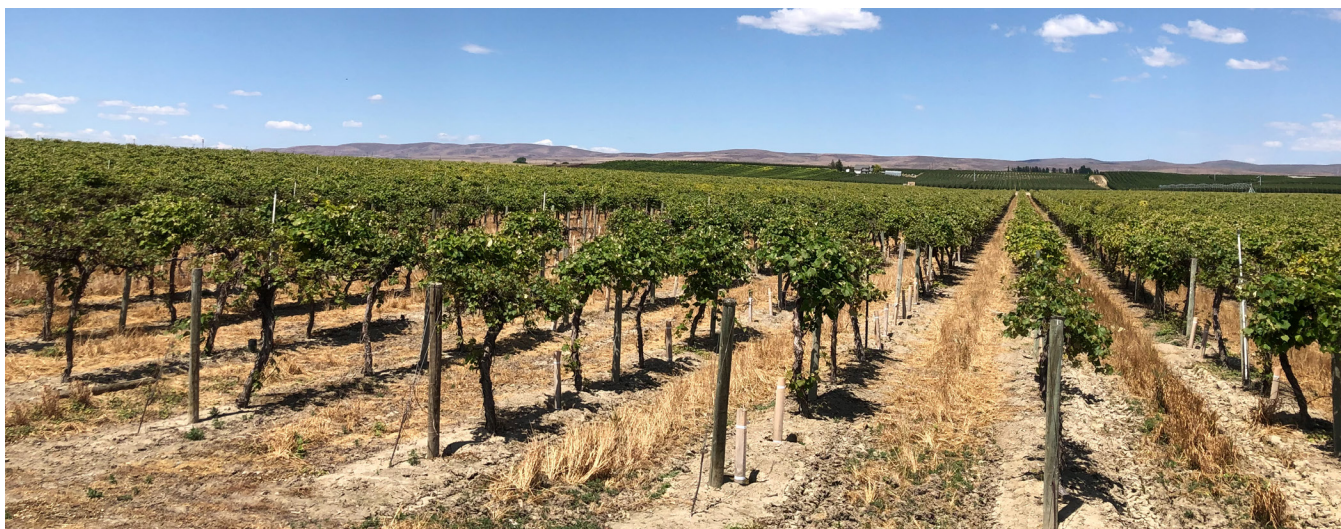
Figure 27. Mowed ground cover between juice grape rows.