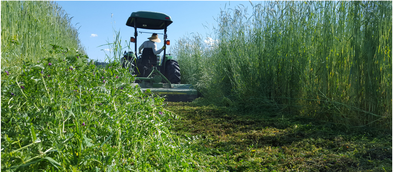
Figure 39. Researchers evaluating novel cover crop termination methods for use in organic farming.

There is a role for plant breeders to work with growers to develop locally adapted crop varieties that do well in no-till systems.