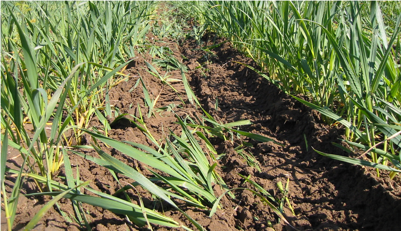
Figure 16. Strip till planting of sweet corn into green cover.