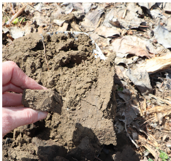
Figure 32. Soils from a gala block.

Soil types in the Central Washington tree fruit growing region contribute to the challenges. Soils are notoriously patchy with individual fields sometimes composed of multiple soil types resulting in a lack of uniformity throughout the field. In some areas caliche (hardened calcium carbonate) soils result in layers which constrict root growth and water movement and contribute to increased pH, buffering capacity and nutrient imbalances. The soils in the growing region also tend to have a high pH, which can limit micro-nutrient availability.