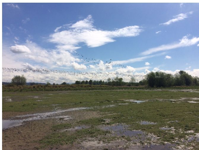
Figure 36. Researchers gather soil samples in organic fertilizer trial.

Other specific challenges identified by this group include suburbanization and land use changes around these farms, many of which are in peri-urban areas lacking strong agricultural infrastructure; knowing how to maximize soil health for the diversity of crops on each farm is challenging; growers' ability to experiment is limited by finances and time.