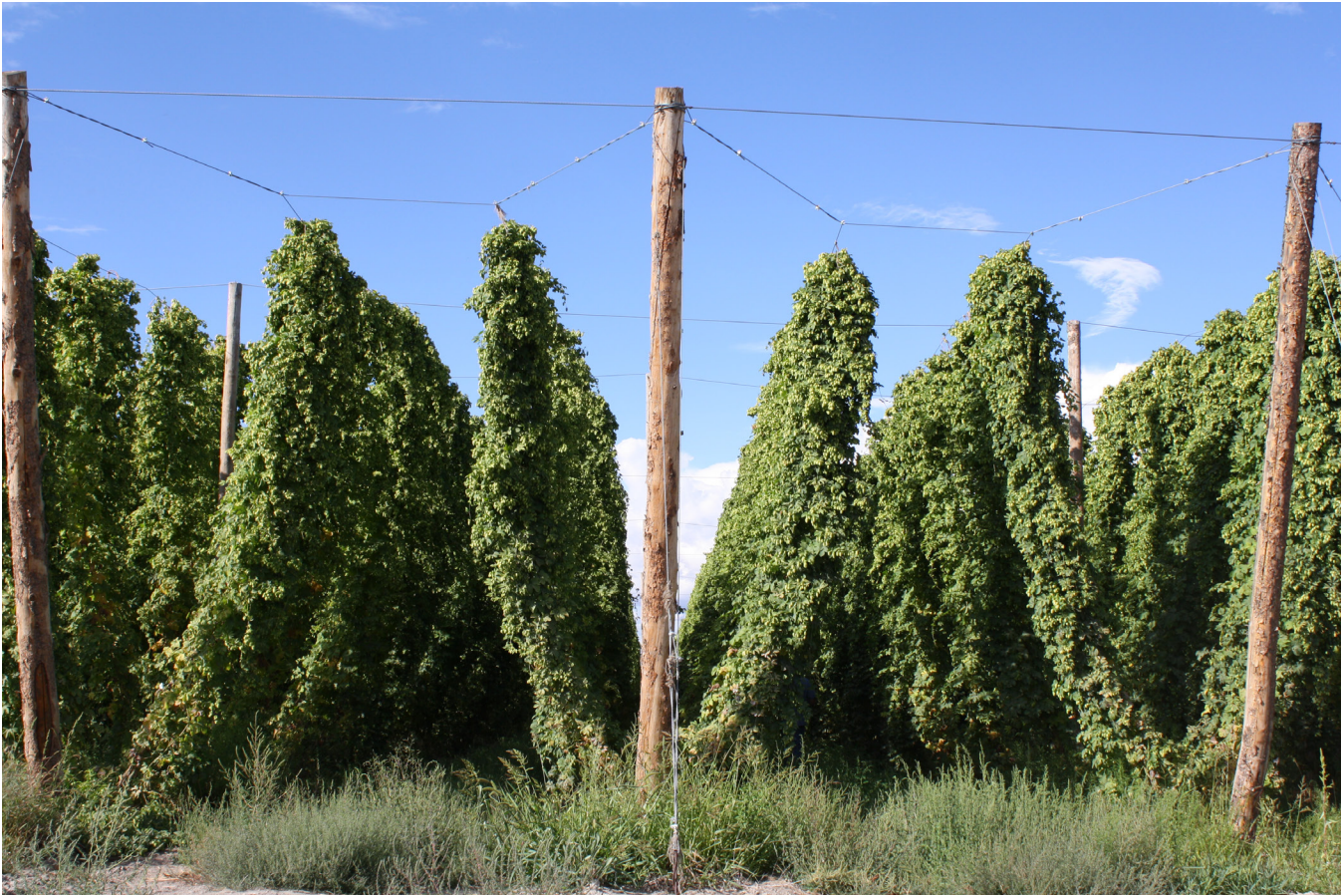
Figure 13. Hop trellis system.