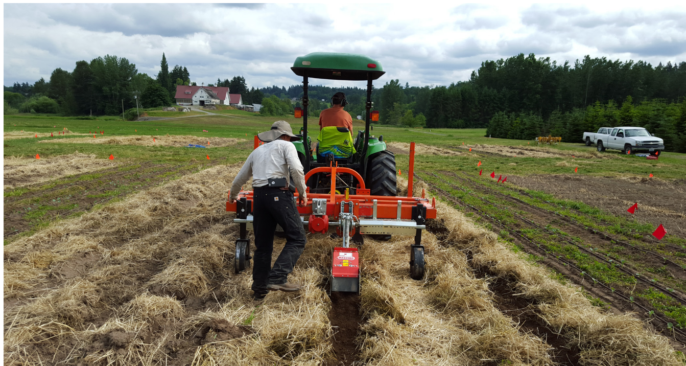
Figure 34. Researchers evaluating strip tillage as a means to protect soil health.