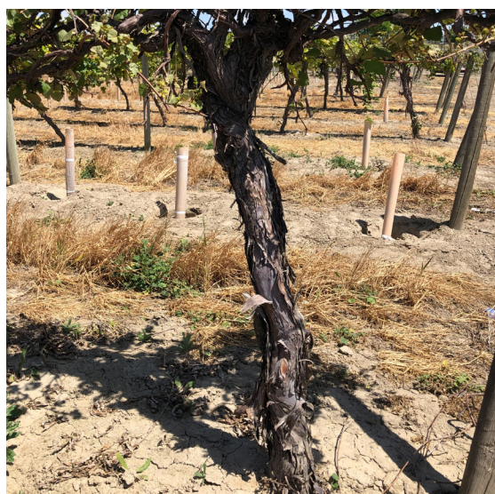
Figure 25. Grape plant exhibiting chlorotic symptoms.

Cover cropping to prevent soil erosion and aid in weed