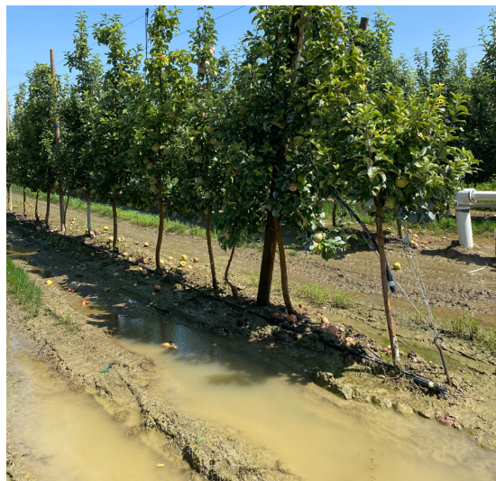
Figure 31. Soil compaction in tree fruit leads to reduced water infiltration.