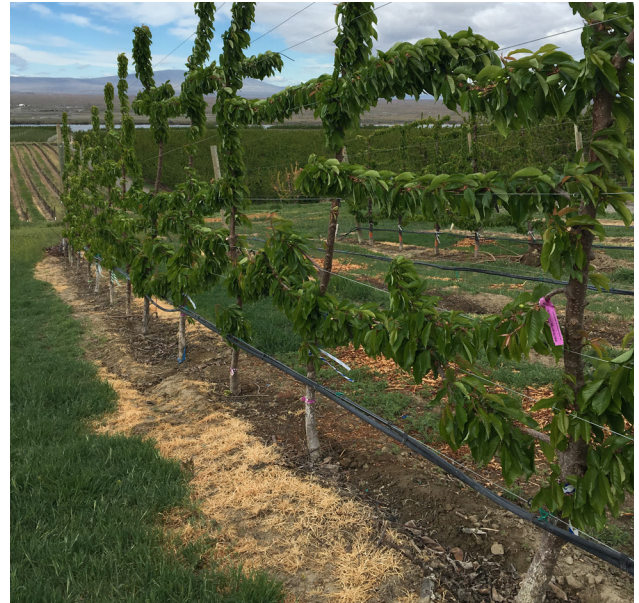
Figure 33. Sweet cherry intensive cropping systems.