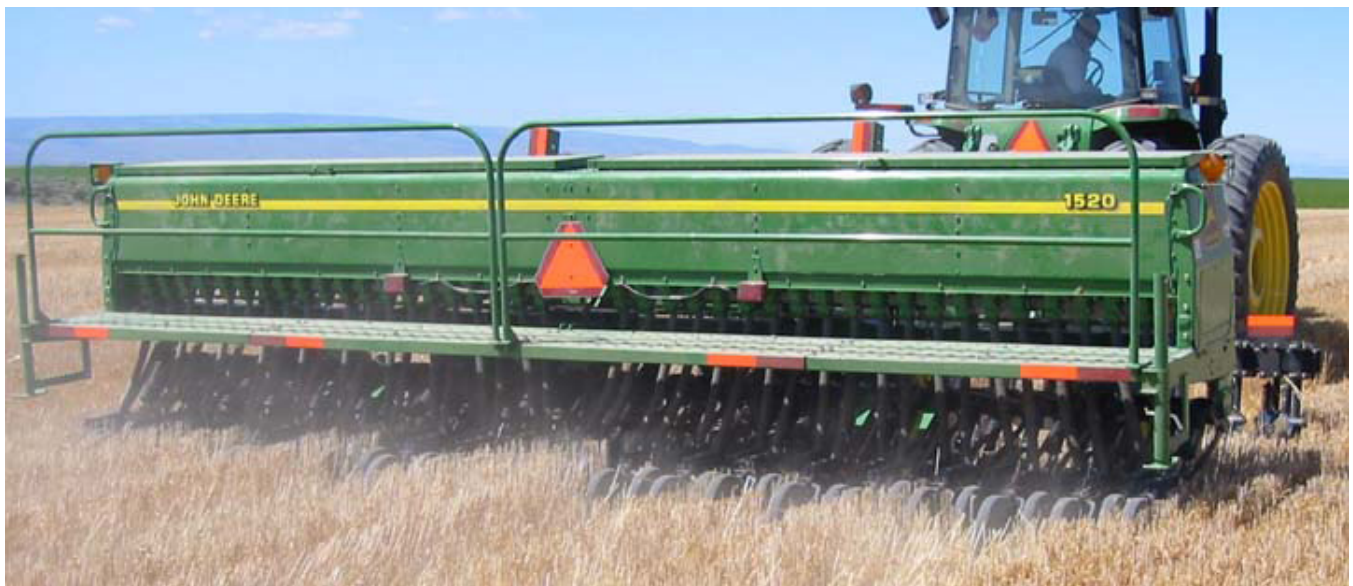
Figure 19. No-till drill planting a cover crop into wheat stubble.

“Tissue testing looks like an important tool, along with the forms of the nutrients being applied.”