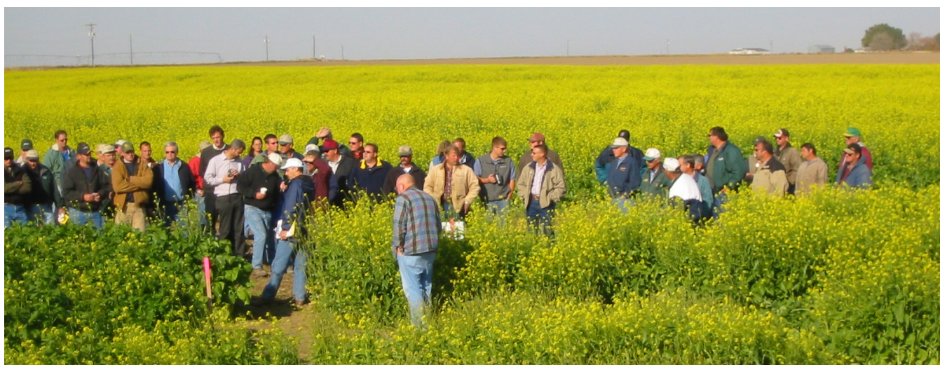
Figure 10. Researchers showcasing cover crop trials at a field day.