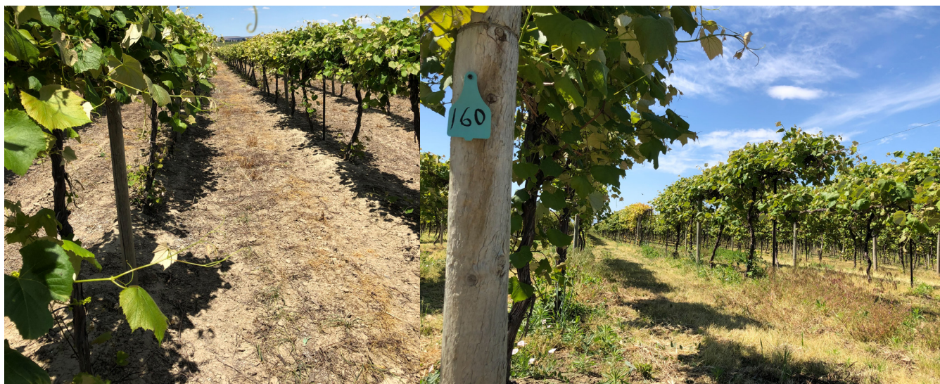
Figure 26. Juice grapes with no ground cover (left) and with grass cover (right).

management is critical. Grapes are drip irrigated so there is minimal moisture mid-row. Growers are often concerned that cover crops compete with water and nutrient resources for grapes and may possibly decrease berry quality. Yet research has shown that in the right conditions it can be a powerful tool to help control vine vigor and assist with canopy management (Tesic et al. 2007). Volunteer plants can easily establish as cover crops mid-row, but intentional establishment of specific cover crops can be more challenging with the limited water. More than a decade ago, there was research on testing different grasses and legumes as cover crops. There has also been research on native plants used to attract beneficial insects and cover crop use, but it has not been widely adopted. Current research is focusing on the use of Litchi Tomato, oilseed radish, clover, and/or brassicas as a pre-plant cover crop with the intent of baiting nematodes. Of interest to viticulturists is the use of complementary cover crops that mitigate soil erosion, weeds, and possibly fix nitrogen.