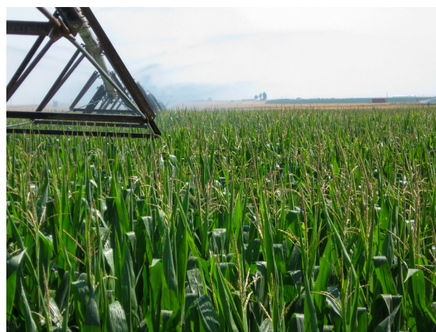
Figure 9. Irrigated sweet corn in the Columbia Basin.

There were six respondents (four producers, two crop consultants) who listed grain or silage corn as their main crop. The importance of issues related to soil health that were most frequently mentioned as being of high importance for this group were soil organic matter (SOM) level and soilborne disease. Cover crops, double cropping, green manures, no-till, and reduced tillage were identified as issues of high importance by the 50% or more of respondents. The most important challenges identified by this group were short term land leases, high cost of soil improvement practices, managing high levels of crop residue, rotation restrictions, and low residue crops. The areas of research that were most frequently identified as being of high importance for this group were monitoring soil health and strategies for improving soil health. One grower in this group offered the following comment: