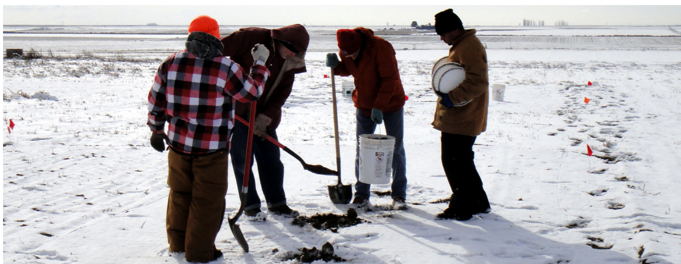
Figure 11. Researchers obtaining soil samples a part of soil health evaluation.