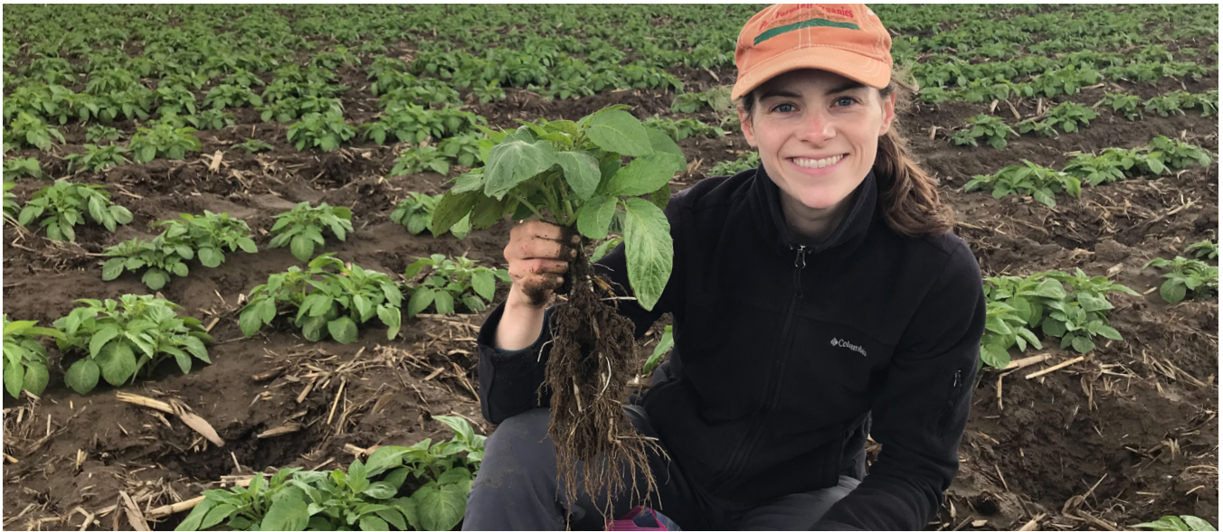
Figure 21. Researcher obtaining potato root samples to evaluate the soil-root microbiome.