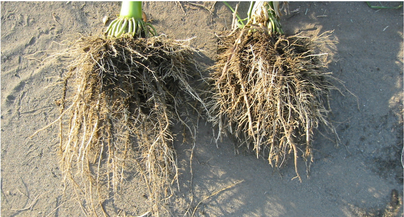
Figure 14. Root system of strip tilled corn (left) and full tilled corn (right).

“Importance of organic matter and the soil on Columbia Basin.”