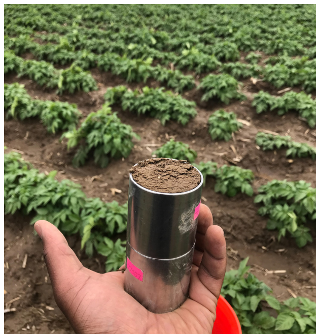
Figure 23. Researchers taking soil bulk density samples to evaluate soil health in Columbia Basin potato fields.

Another barrier involves low levels of blemishes acceptable due to nematodes. For fresh-market potatoes various soilborne pathogens cause cosmetic damage that reduces quality and value. Currently, these issues are managed with fumigation. There is substantial pressure on growers to maximize yields. High yields are necessary for a profit under the terms of processing contracts. For several decades soil fumigation for disease control has successfully and consistently maximized yields.