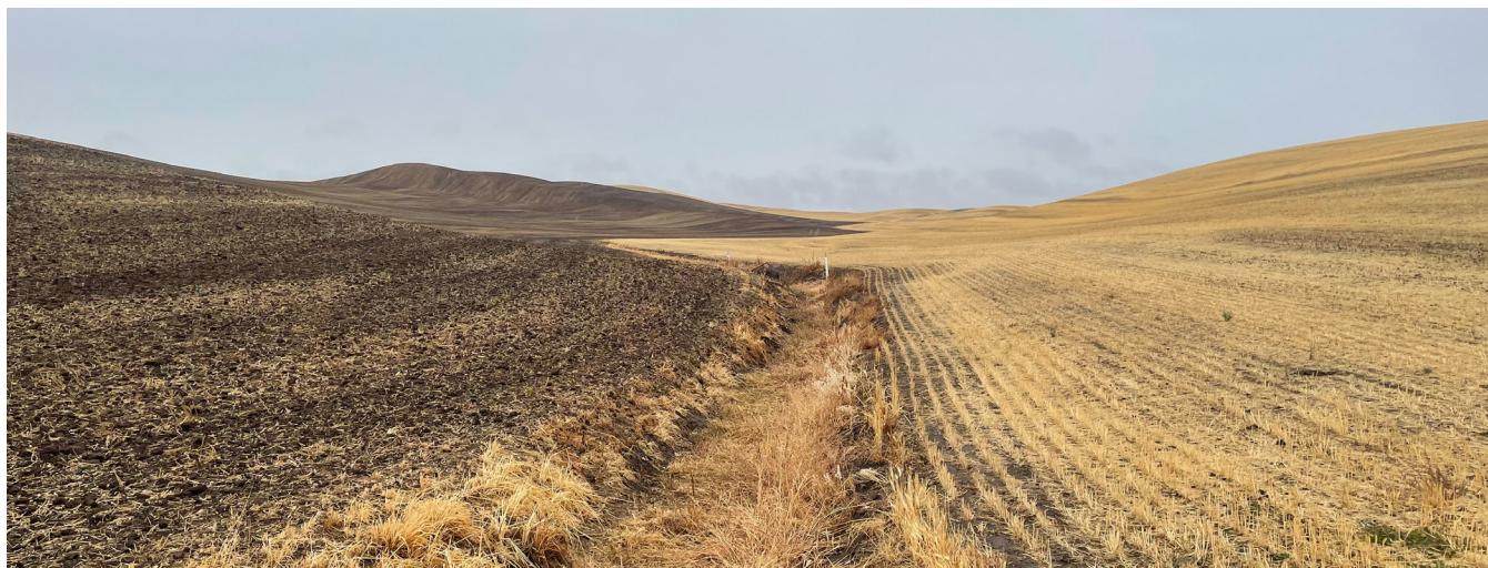
Figure 5. Tilled wheat field (left) and no-till wheat field (right).

Farmers in dryland areas understand that no-till/direct seeding has improved soil structure and water infiltration and percolation rates. However, they are concerned about soil physical properties such as compaction associated with the adoption of reduced tillage practices. With no-till/direct seeding, farmers can enter a field earlier in the spring to spray and plant while the soil is at a higher moisture content. This has promoted more soil compaction and, coupled with less tillage, has made it more challenging to remediate subsoil compaction.