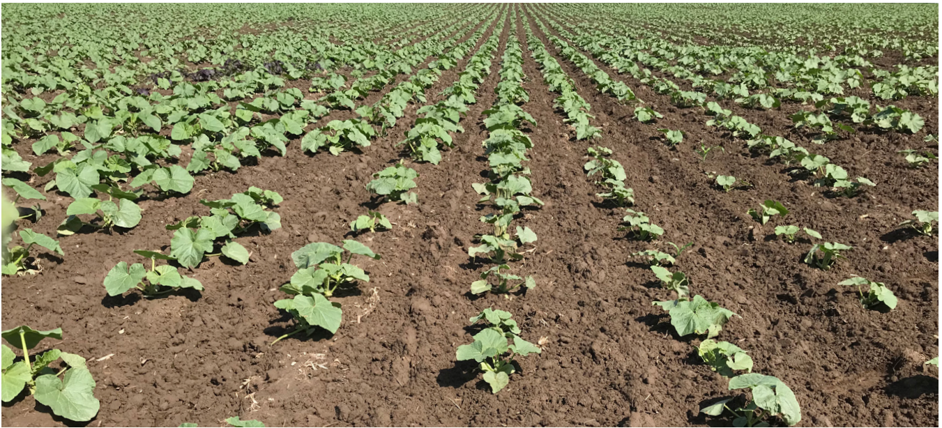
Figure 17. Cucurbits grown in the Columbia Basin.