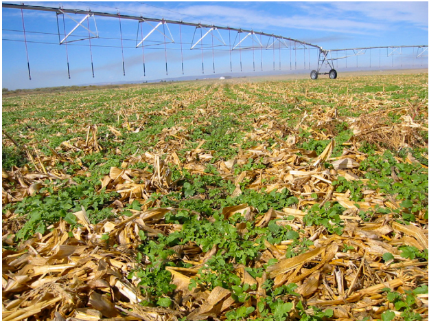
Figure 8. Irrigated mustard cover crop emerging after sweet corn.

The Columbia Basin is prone to high wind events especially in the spring and fall, often when soils are not adequately covered with crops, plant residues or other vegetation. Wind erosion removes fine particles and organic matter from the topsoil which results in lower soil productivity, fertility, water-holding capacity, tilth, structure and water infiltration on dryland and irrigated soils. Unprotected sand, loamy sand and sandy loam soils are the most susceptible to wind erosion (McGuire 2011). Additionally, blowing dust can result in serious traffic accidents, loss of productivity, air quality issues, and respiratory problems in communities surrounding farmland. Efforts to control wind erosion are an ongoing challenge being addressed through the use of cover crops, high crop residue farming, and addition of manure and compost on the most prevalent wind-blown soils. Major efforts are continuing to improve soil health using multiple management strategies thus reducing soil deterioration.