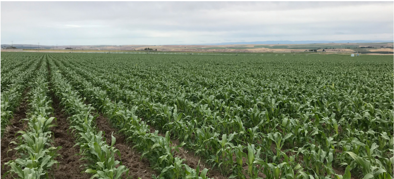
Figure 18. Columbia Basin sweet corn.