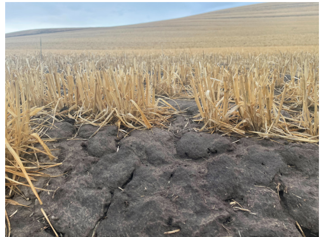
Figure 3. Soil erosion within wheat stubble.

Erosion in the inland PNW has been the result of several factors including: 1) extensive use of conventional tillage; 2) predominance of winter precipitation with the potential for frozen soil and runoff; 3) steep and irregular topography that does not lend itself to conventional structure or landscape modification practices to control erosion; and 4) a winter wheat cropping system that leaves the soil nearly bare during the winter precipitation season. While erosion by water has been a major soil health and environmental concern, wind erosion is also a problem, particularly in the Columbia Plateau region of the inland PNW where, historically, lower annual rainfall amounts led to rotations that alternate between crop and tillage fallow.