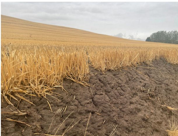
Figure 4. Field edge soil erosion.

By the 1970's it became clear that major changes in farming practices were needed in the inland PNW to reduce erosion rates. The STEEP special research grant was initiated in 1975 (Kok et al. 2009) to address soil erosion concerns in the inland PNW. The CP3 special research grant was initiated in 1993 to focus primarily on wind erosion on the Columbia Plateau sub-region of the inland PNW. Both projects involved integrated research and education and a systems approach that addressed all of the characteristics of conservation farming from planting to harvesting. Through the successful development of conservation technology and farming systems, soil loss rates were reduced to five tons per acre per year or less per year with long-term benefits of improved soil, water, and air quality (Kok et al. 2009).