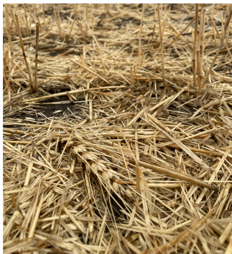
Figure 6. Surface wheat residue in the Palouse.

No-till/direct seeding coupled with high yields can pose problems with residue (particularly winter wheat) management. Increased restrictions on residue burning have led to more baling and removal, which removes large quantities of basic cations such as potassium, calcium, and magnesium in the residue, as well as smaller quantities of other secondary and micronutrients. The opening of a straw pulping plant in Starbuck, Washington has provided an economic incentive to remove more residue. The long-term consequences of residue removal bear careful monitoring.