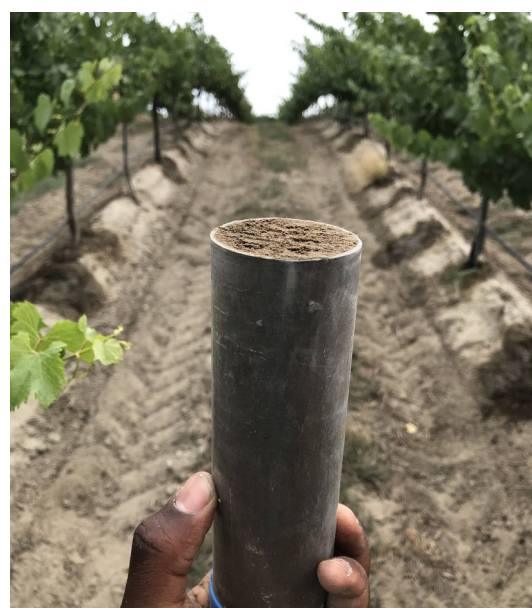
Figure 28. Soil scientists sampling soil bulk density in vineyards to quantify soil health.

Washington State University no longer has dedicated weed or soil scientists working in grapes or perennial fruit crops. In 2021, USDA Agricultural Research Service hired a soil scientist located in Prosser, Washington, and his research focus on soil microbial communities is a collaboration opportunity for scientists working in related disciplines. There is a strong relationship between industry and research scientists and extension educators. Some industry members participate on national boards, like the National Grape Research Alliance, that bridge state and national issues and opportunities.