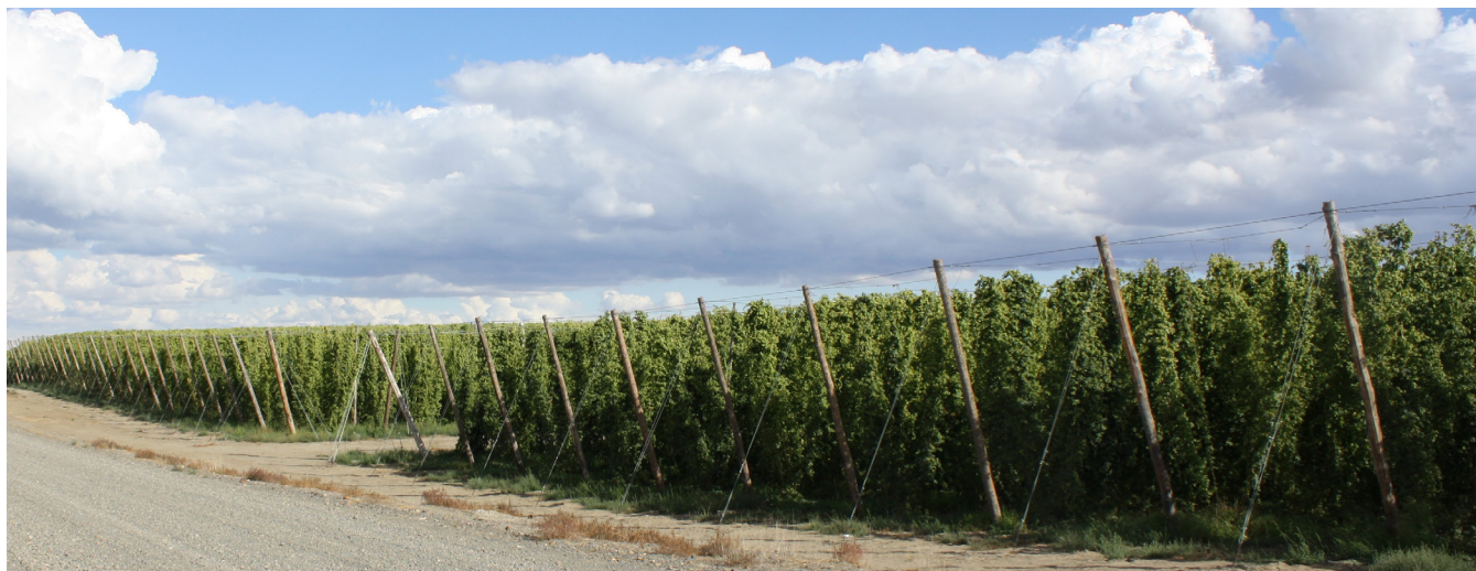
Figure 12. Hop field in Columbia Basin

Four respondents (one producer, three crop consultants) listed hops as their primary crop. Soil organic matter level was the issue of greatest importance to this group, with cover crops, green manures, compost and manure application all listed as practices of high interest to 50% or more of respondents in this group. The high cost of soil improvement practices is the most important challenge identified by this crop group. Strategies for improving soil health is the research area of greatest importance identified by this group.