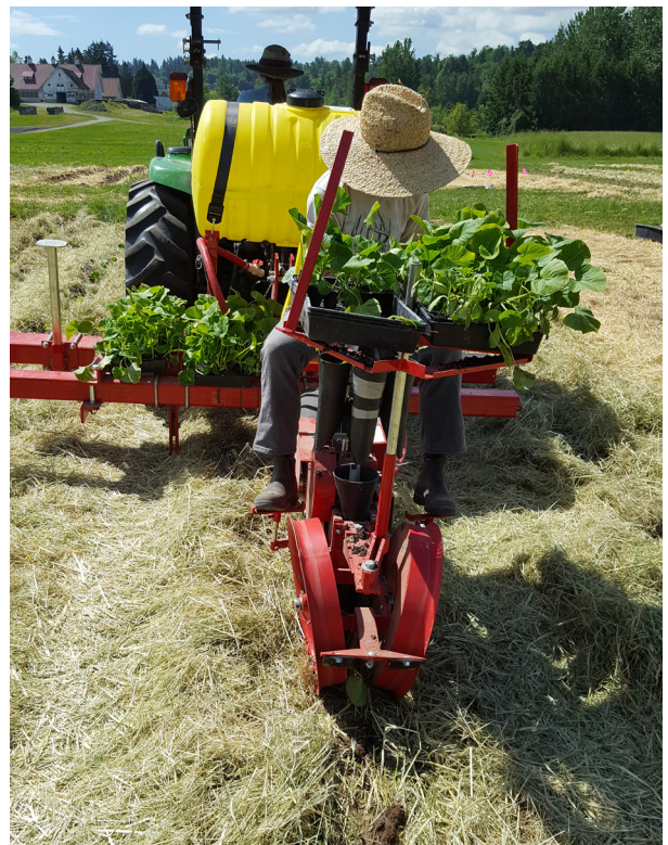
Figure 37. Transplanting squash into cover crop residue.