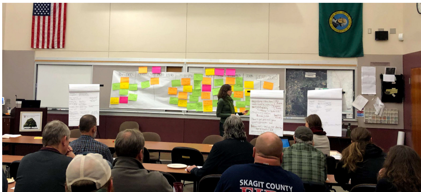
Figure 29. A soil health roadmapping listening event with local producers held at WSU Mount Vernon Northwestern Washington Research and Extension Center.

most commonly grown high-value annual crop. Additional high-value annual crops include tulip and daffodil bulbs, vegetable seed crops (beet, spinach, and cabbage seed), and fresh-market vegetables (broccoli and Brussels sprouts). However, the largest acreage rotational crops (e.g., forages, small grains, silage corn) yield low returns.