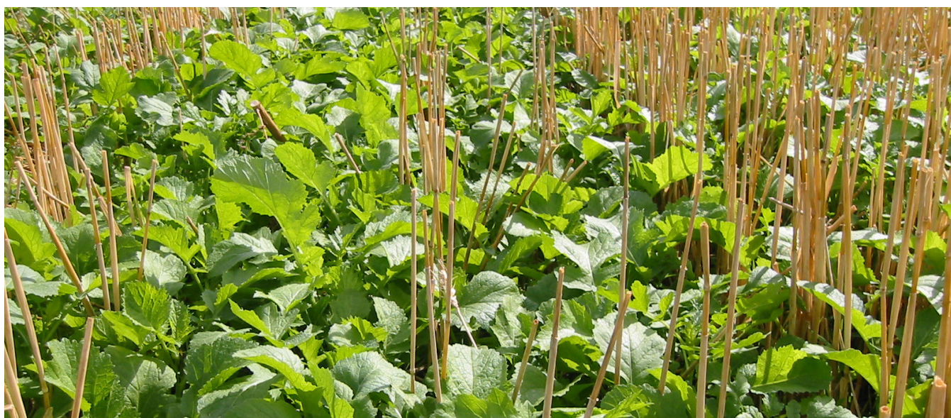
Figure 20. Mustard green manure coming through wheat stubble.