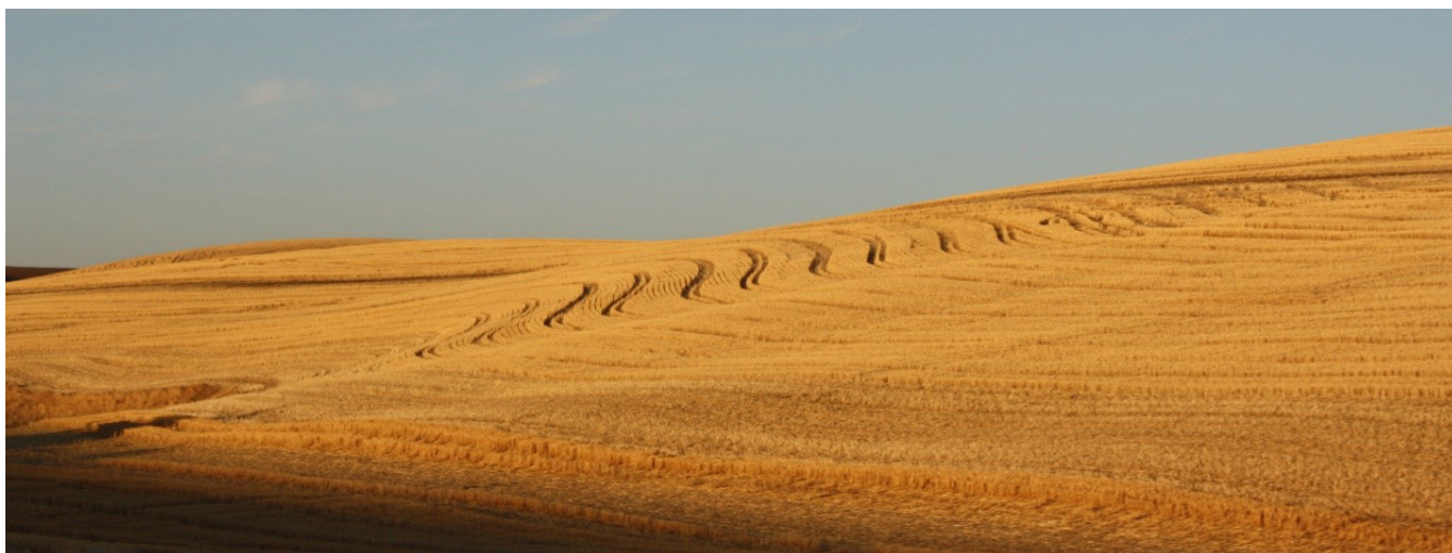
Figure 7. Dryland wheat field after harvest.