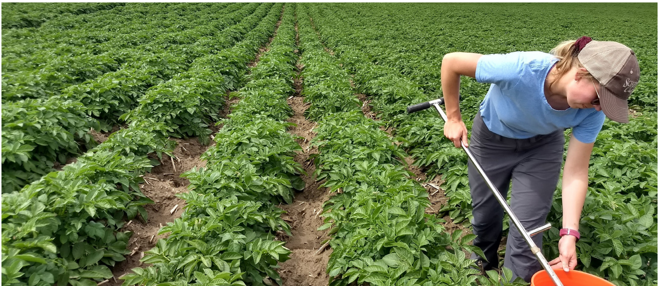
Figure 22. Researchers taking soil samples to evaluate soil health in Columbia Basin potato fields.