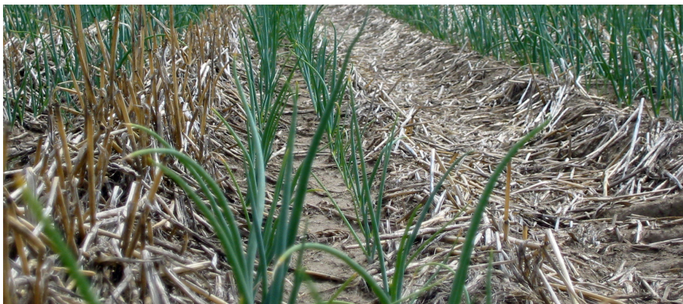
Figure 15. Strip tilled onions.