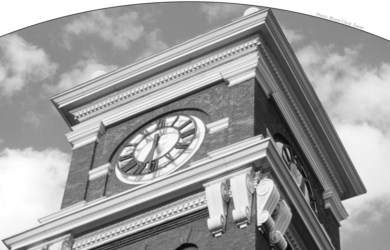
Photo: Bryan Clock Tower

The commencement ceremony at Washington State University serves a dual purpose: to mark a point of achievement, thus completing a chapter in the lives of students and those who support them, and to encourage continued pursuit of learning, personal fulfillment, and engagement with their local and worldwide communities.