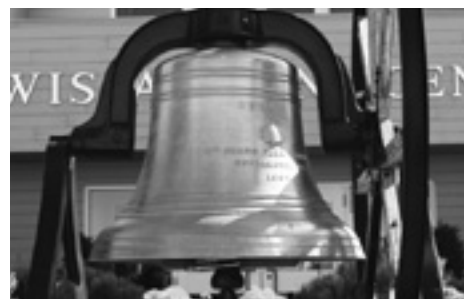
Victory Bell, Lewis Alumni Centre