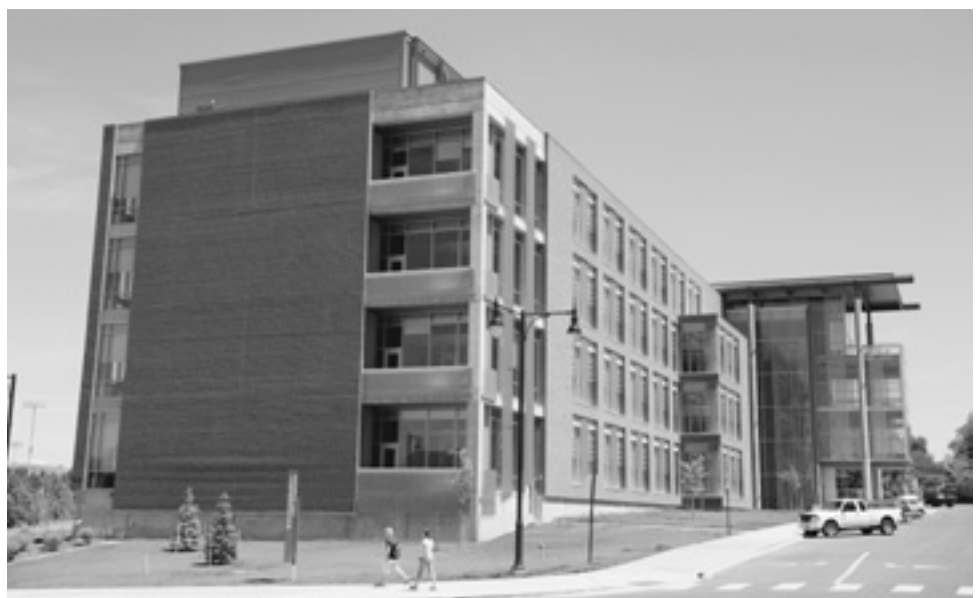
Biotechnology/Life Sciences Building