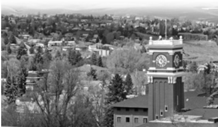
Bryan Hall Clock Tower