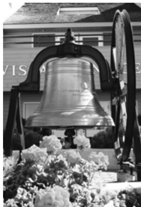
Victory Bell, Lewis Alumni Centre