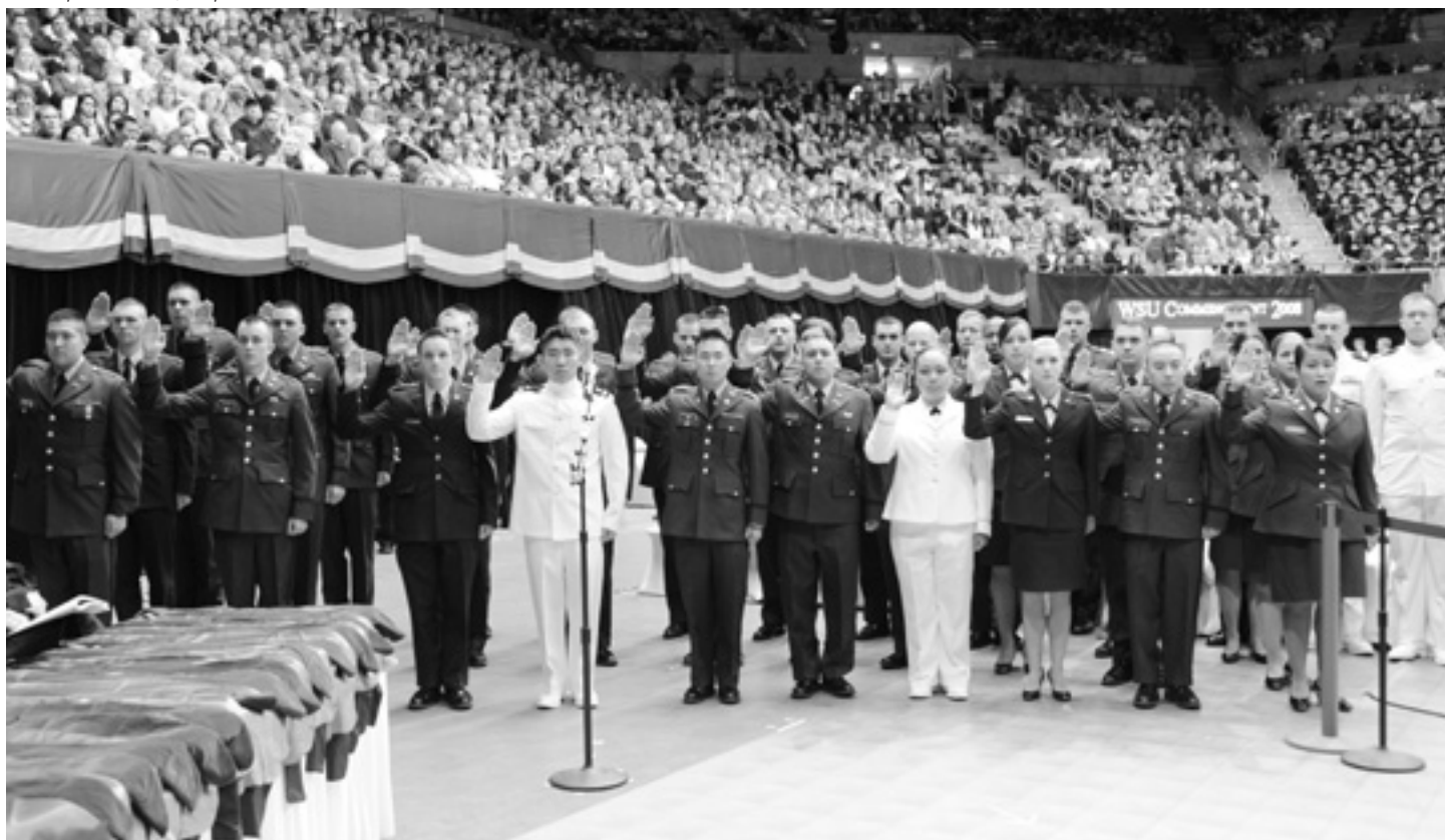
May 2008.