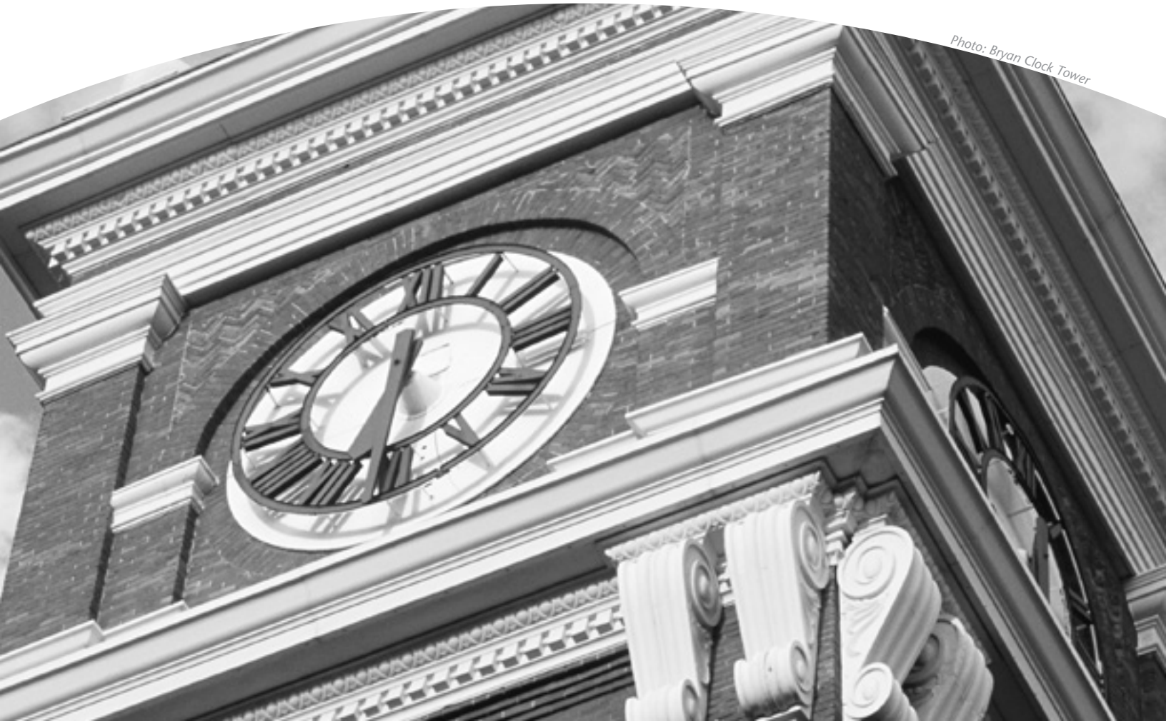
Photo: Bryan Clock Tower

The commencement ceremony at Washington State University serves a dual purpose: to mark a point of achievement, thus completing a chapter in the lives of students and those who support them, and to encourage continued pursuit of learning, personal fulfillment, and engagement with their local and worldwide communities.