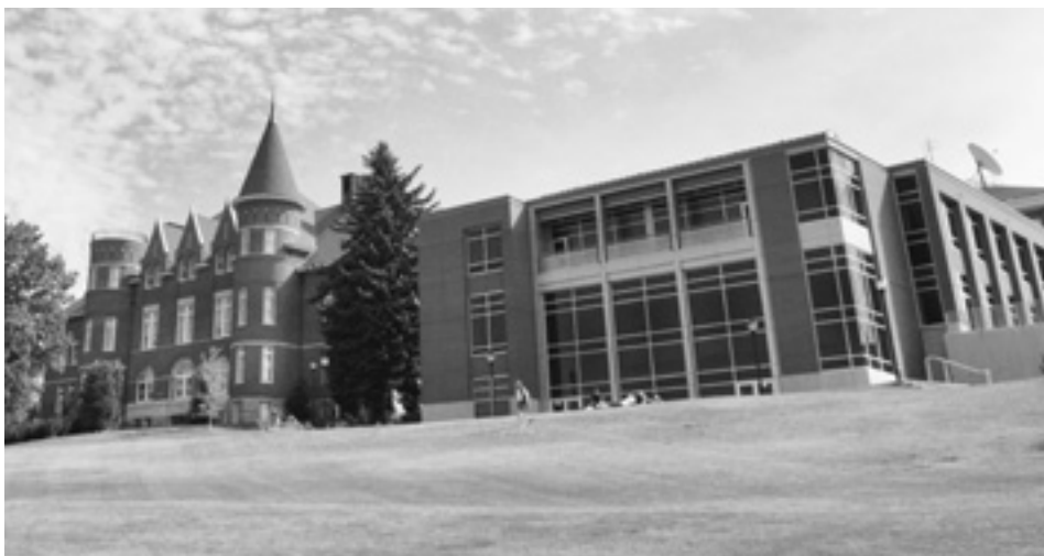
Thompson Hall and Murrow School of Communication Addition