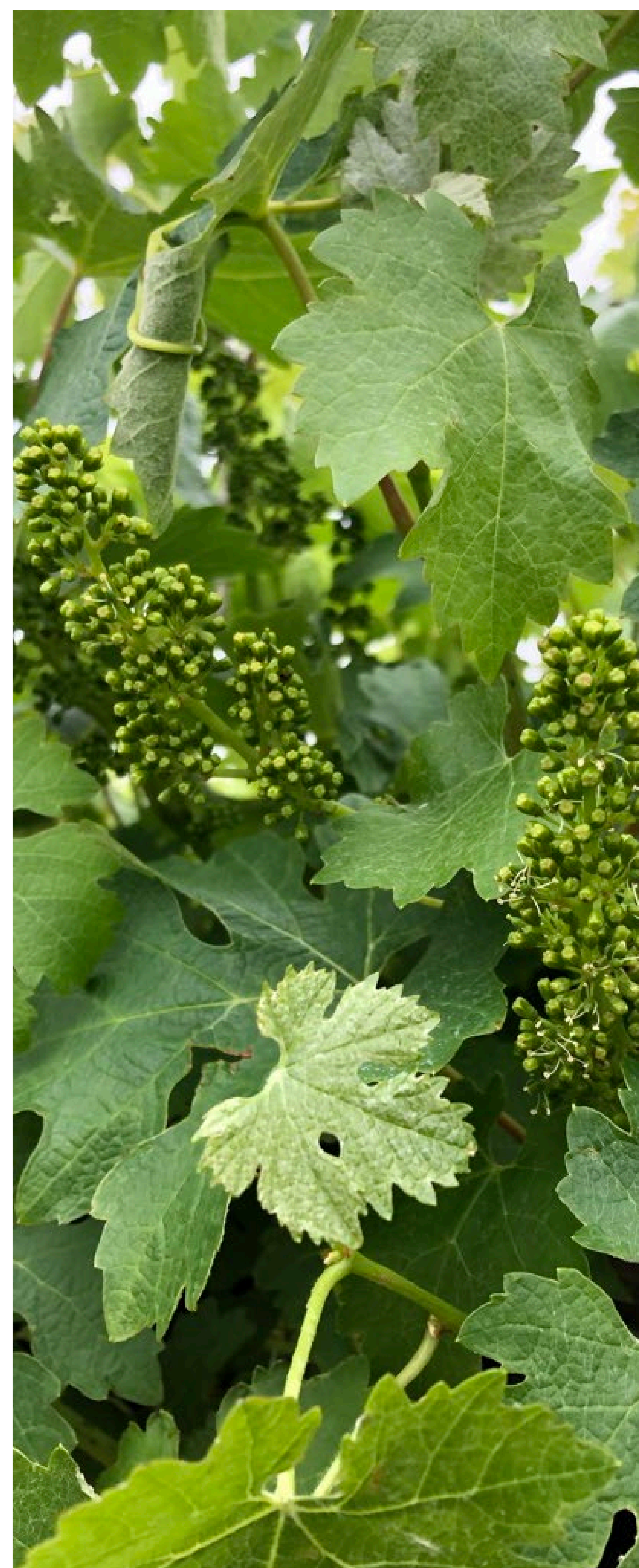
Figure 2: The picture shown above depicts the first signs of bloom in block CS29 at the Ste. Michelle Cold Creek vineyard.