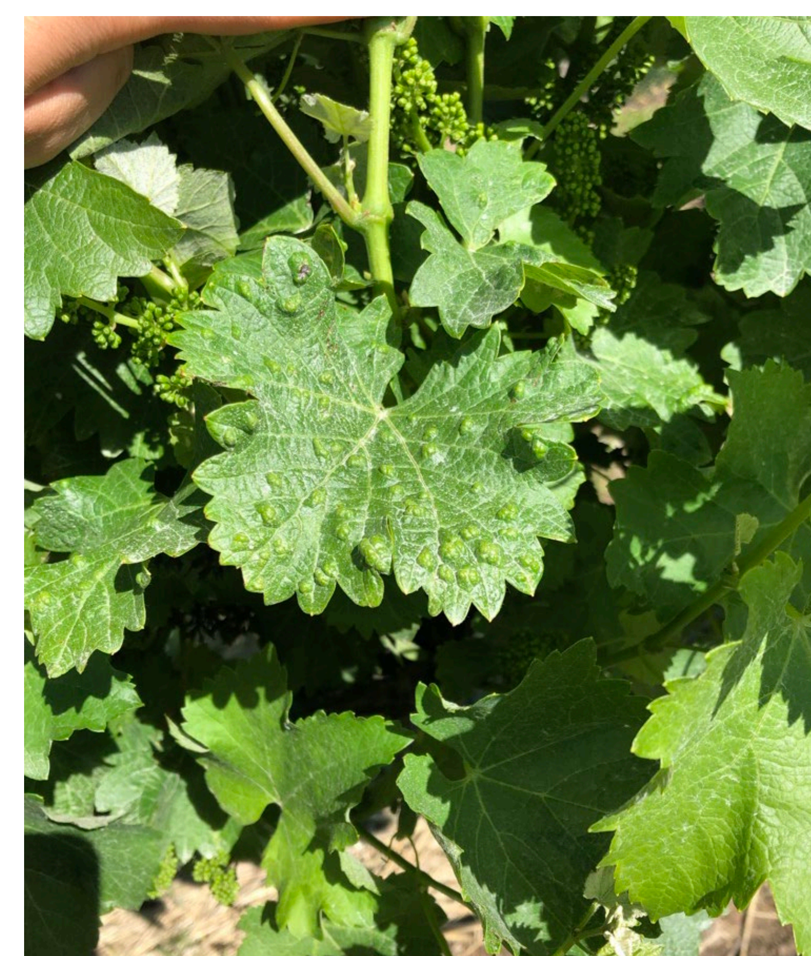
Figure 4: The photograph to the right shows the impact and damage that blister mites have on vegetative tissues of the plant.