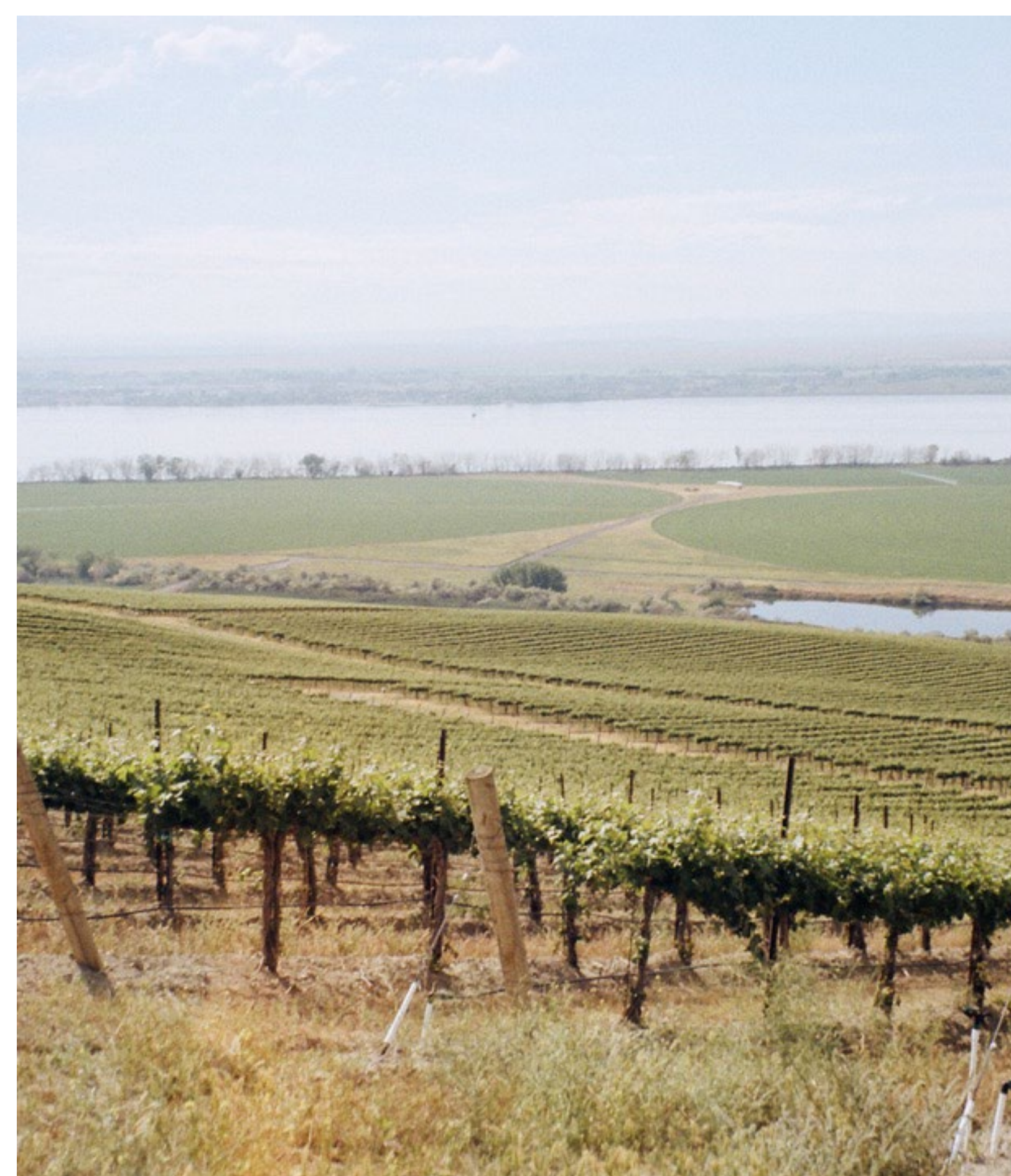
Figure 3: The image shown below illustrates herbicide spray damage to leaves of the canopy.