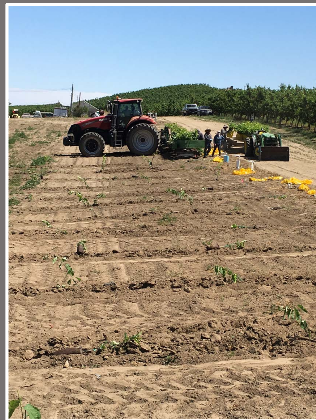
Planting the cherries with a large three row planter.