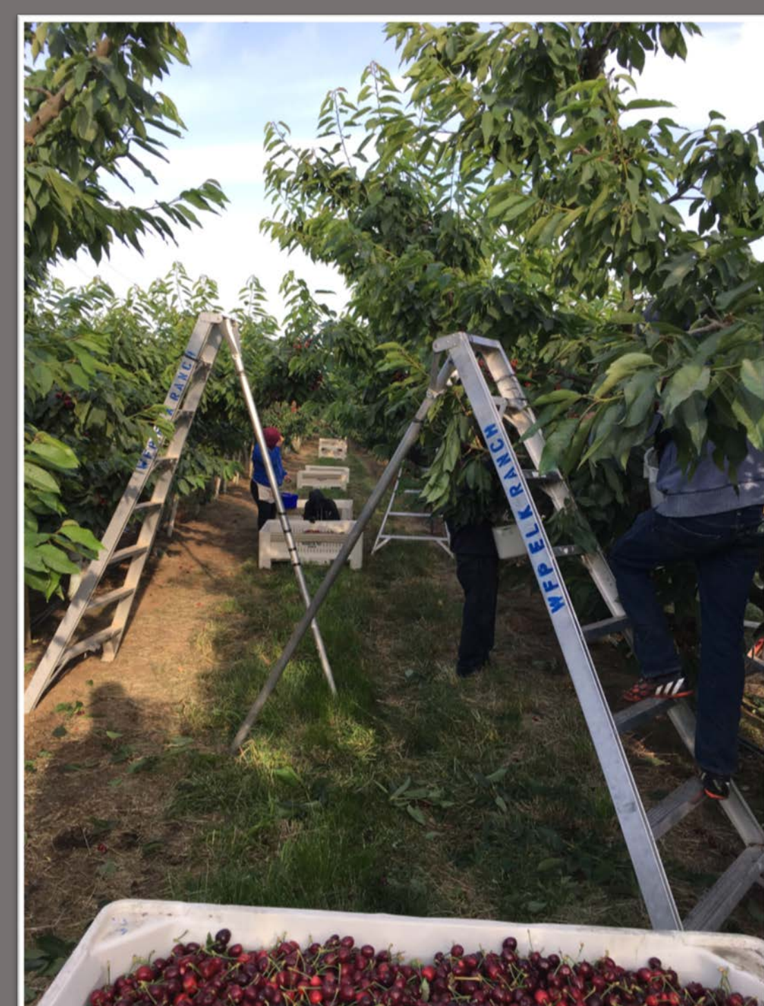
A group of workers picking Skeena cherries.