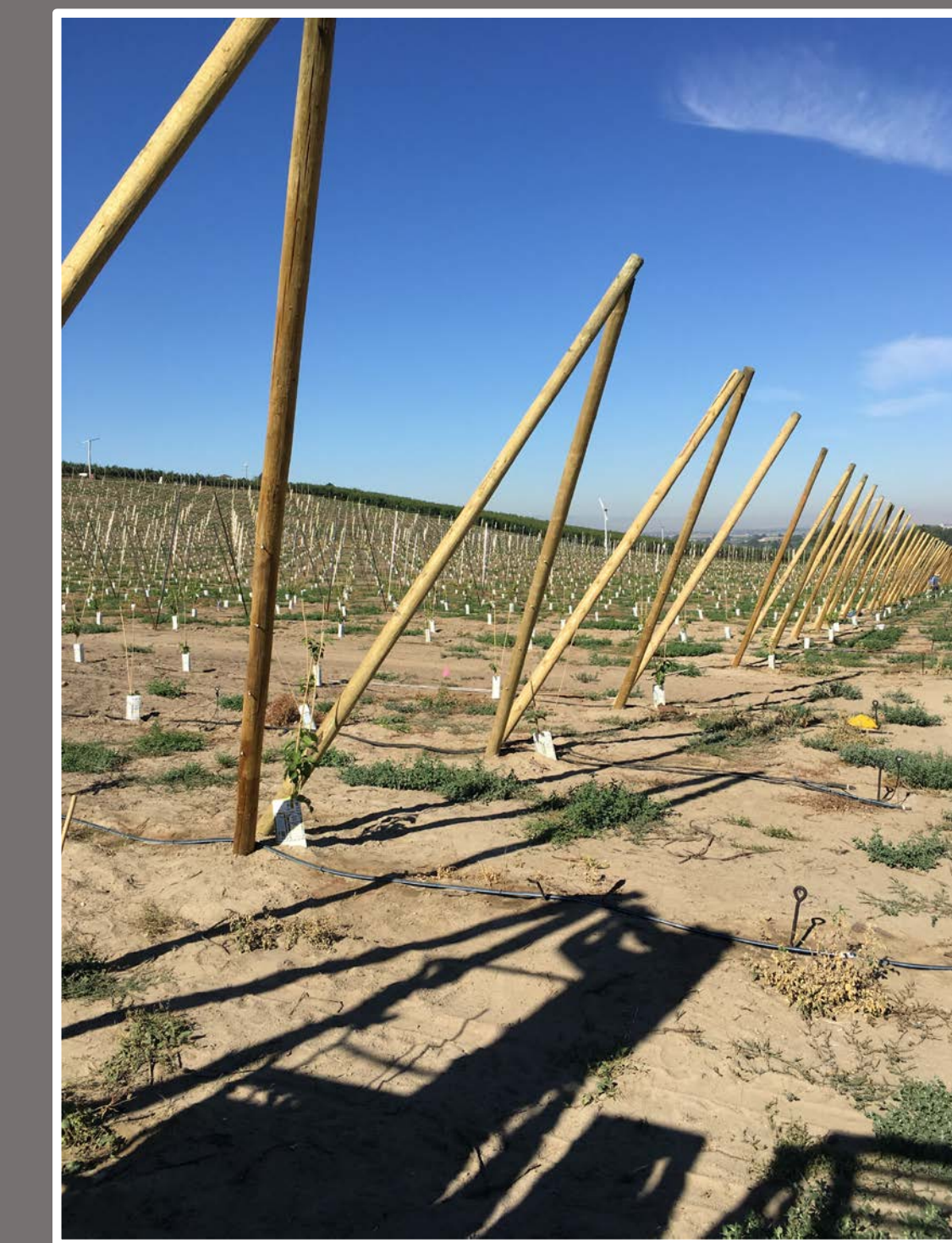
The end-posts and the anchors. You can see the forklift and the workers working in the shadow.