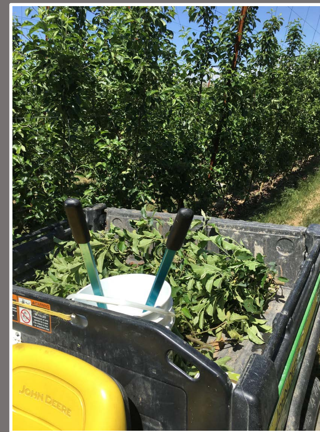
Using a gator to cut and remove blight in an effected Pink Lady orchard.