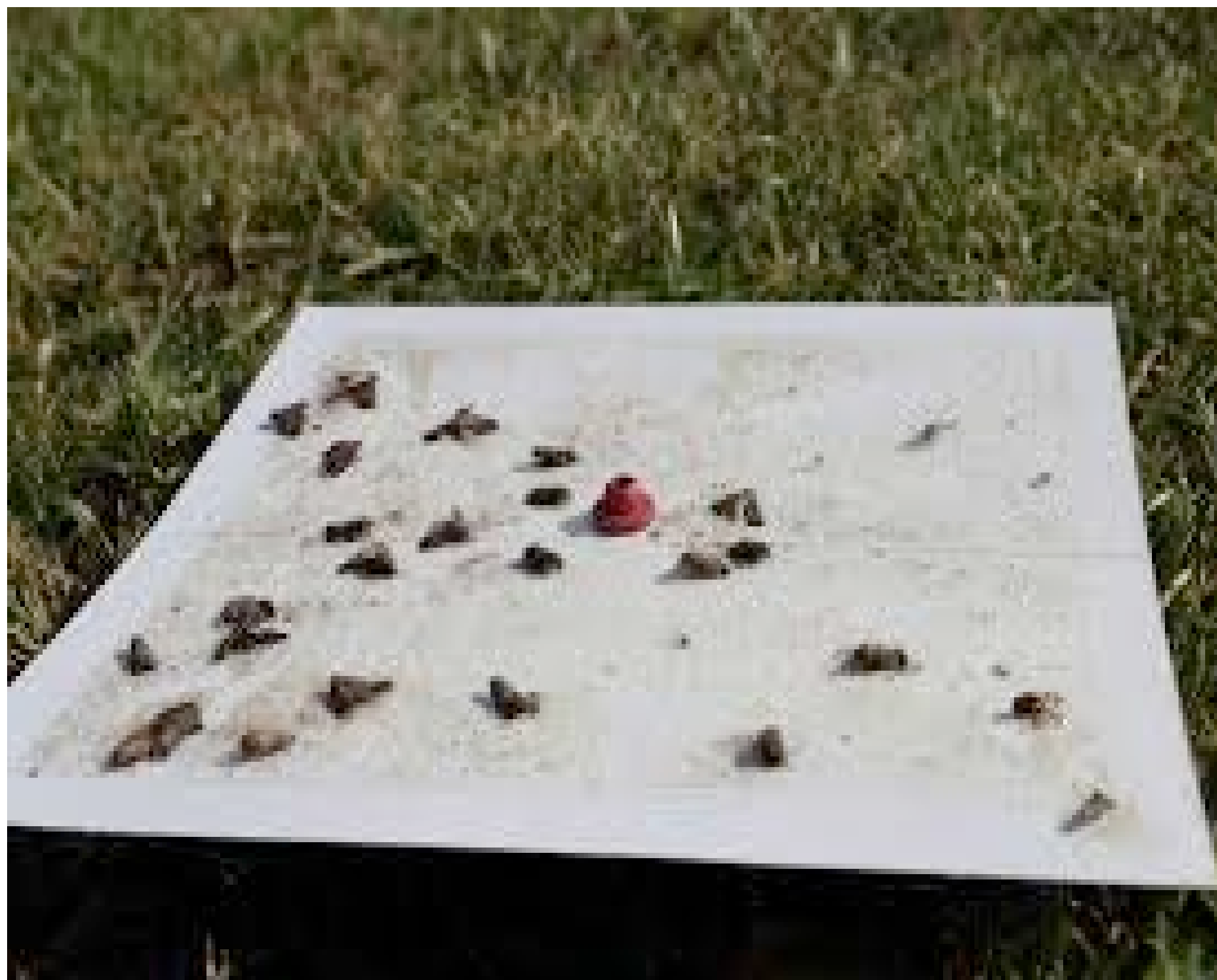
Here is an example of codling moths caught in an apple orchard using liners and lures

G.s. Long Company is a chemical and fertilizer company that is from Yakima, Wa, This company provides growers with solutions for any problems that the growers might face throughout the growing season of their crops. The main solutions that G.S. Long gives are for consulting purposes, crop protection and delivering chemicals that are needed.