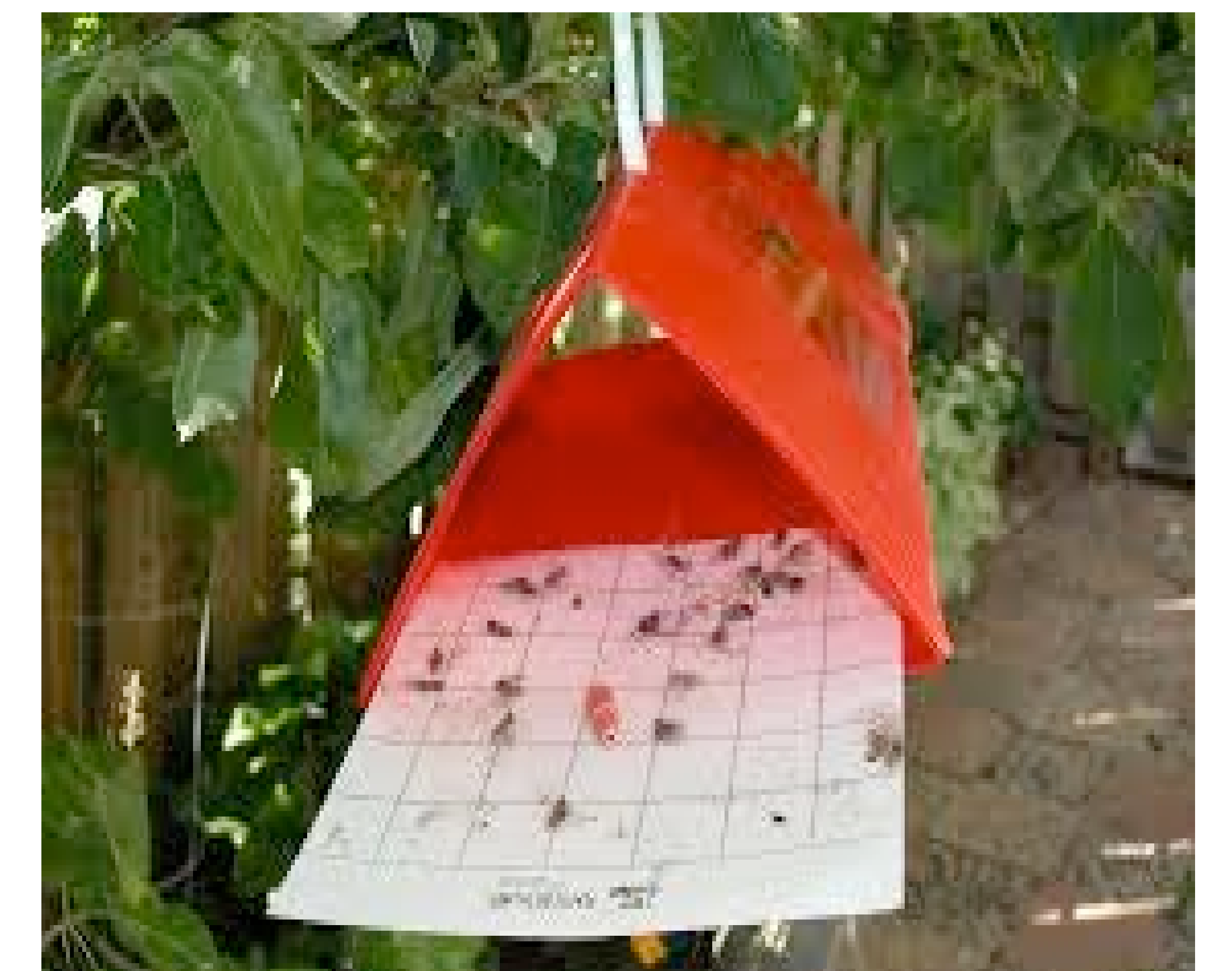
Example of what the traps look like in the orchard