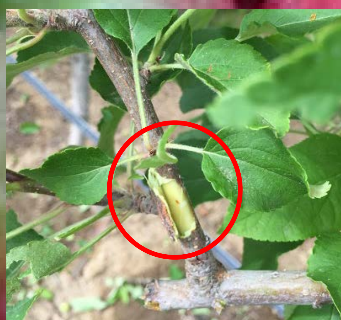
"Dirty Cut". Kanzi summer pruning. Quincy, WA