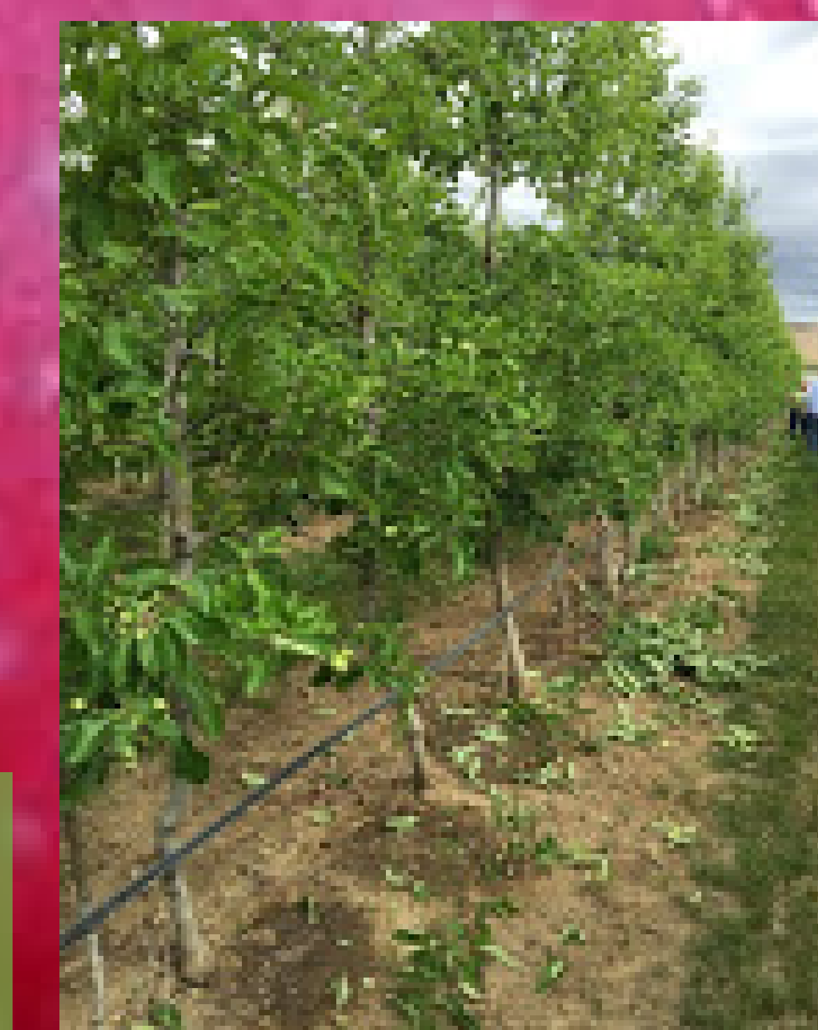
Pruned leaves and wood from Sickle Bar Machine.