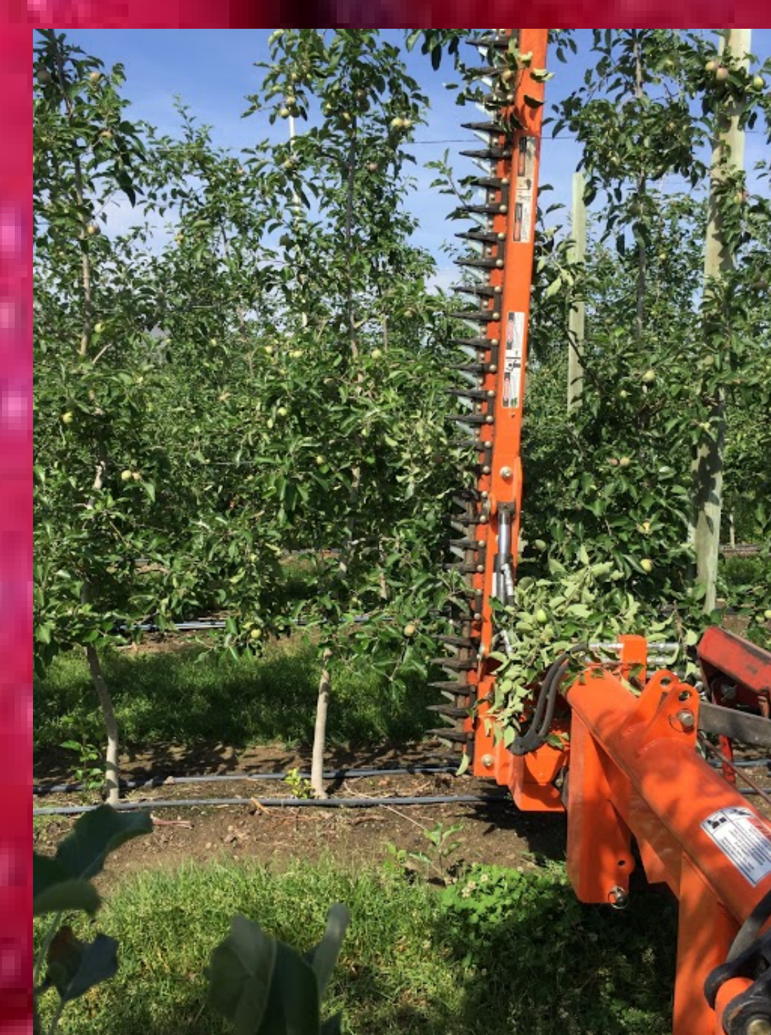
Sickle Bar Machine. Summer Pruning May 29, 2015. Mattawa, WA