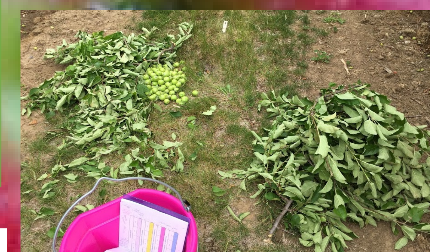
Collecting leaves, wood, and fruit for data analysis from Sickle Bar Machine.