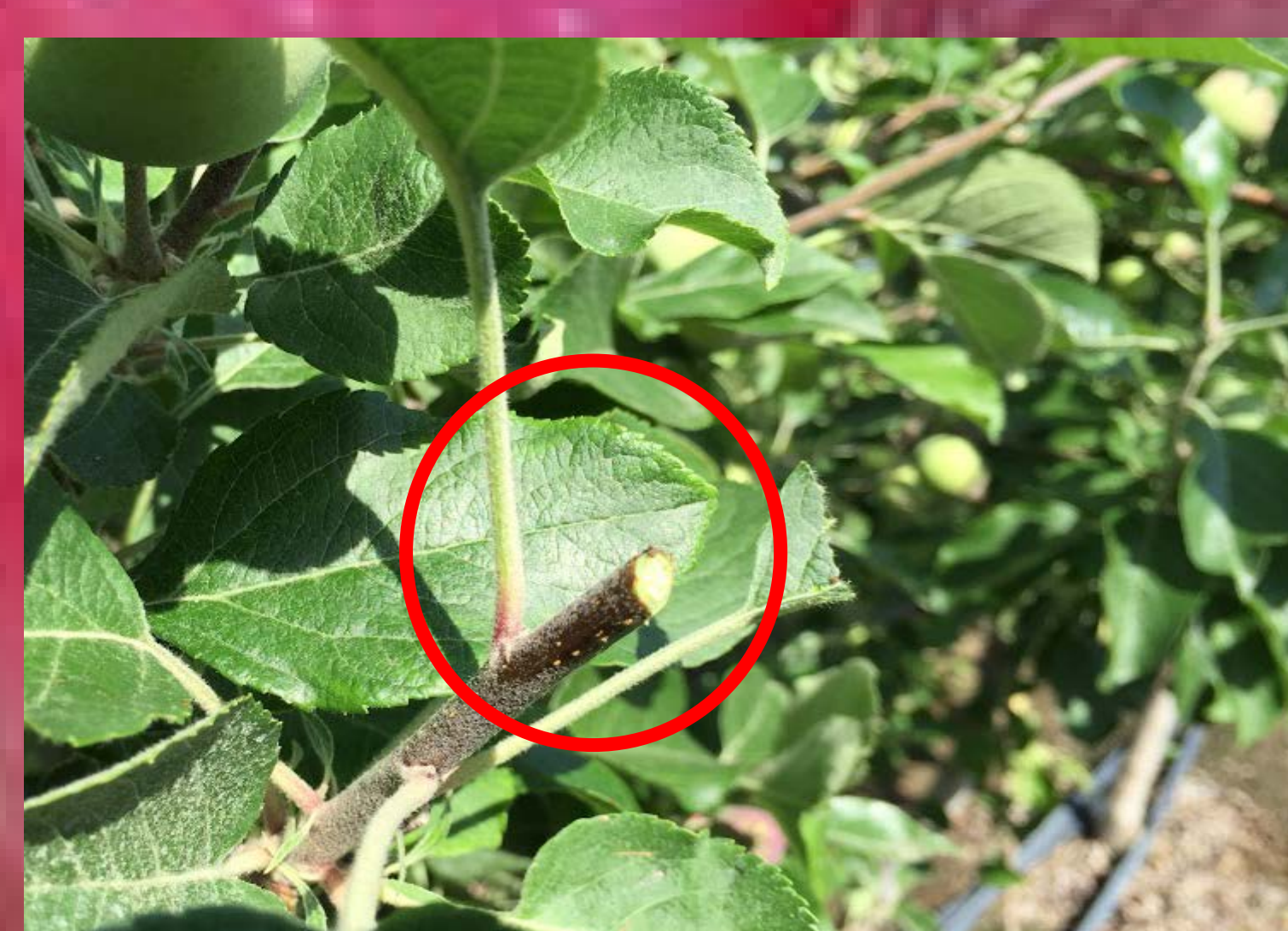
"Clean Cut". Pink Lady summer pruning. Mattawa, WA