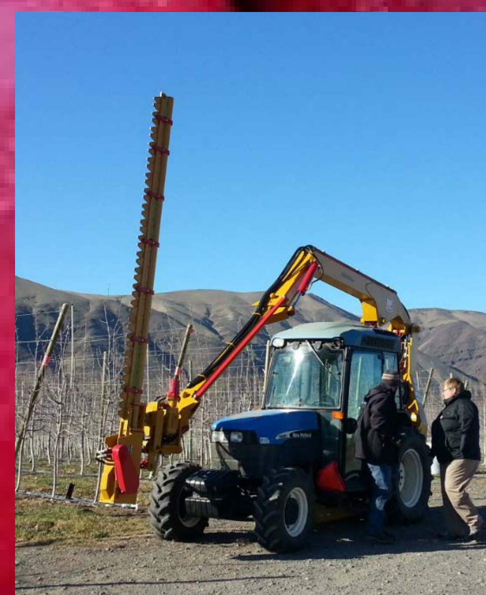
Tractor with Sickle Bar Machine