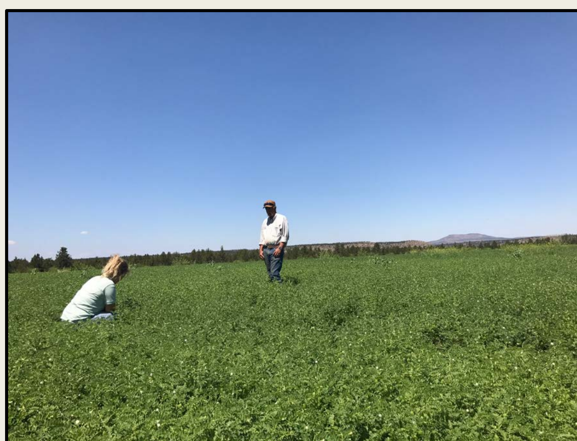
A grower and I looking at the growth and development of the chickpeas. I am doing a soil moisture test and pulling a plant material sample.