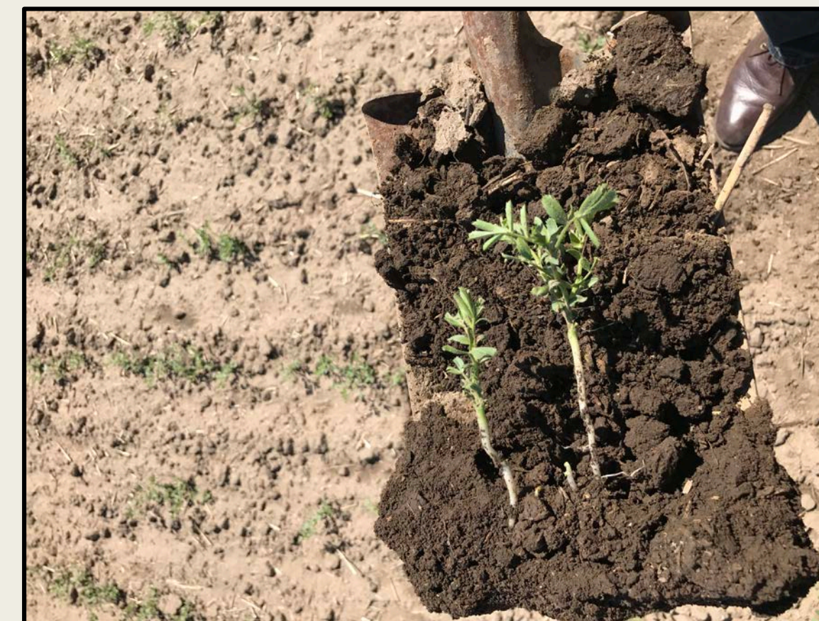
Young chick pea plants 2 weeks after emergence.