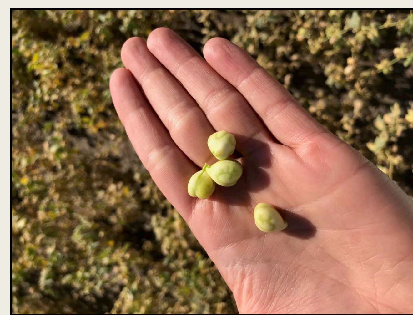
Garbanzo beans 2 weeks prior to burn down (round up application).