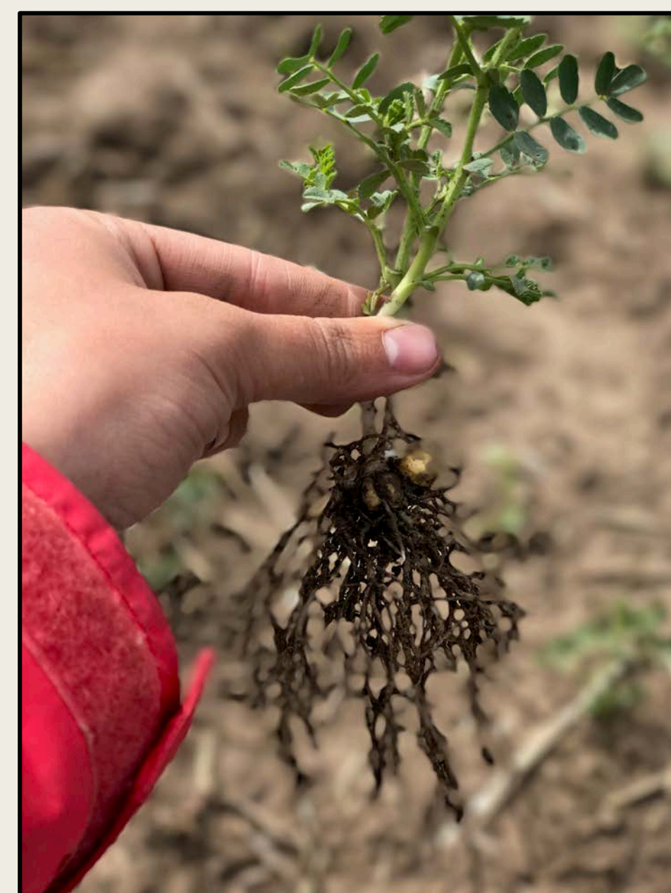
Adolescent plant pulled from a field. Root structure and development being observed and recorded.