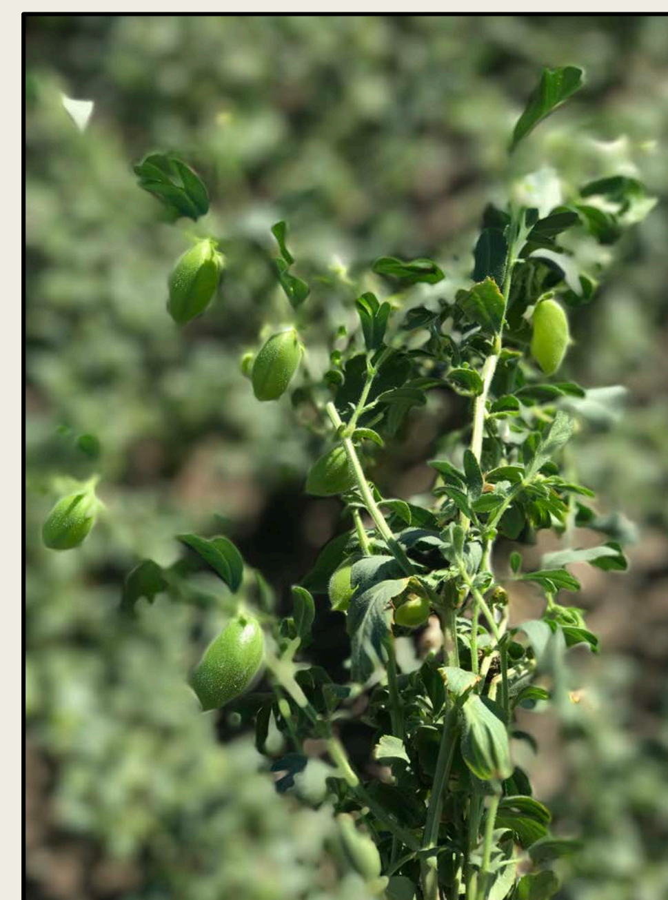
Chick pea plant with pods developed. Each pod contains 1-3 beans.