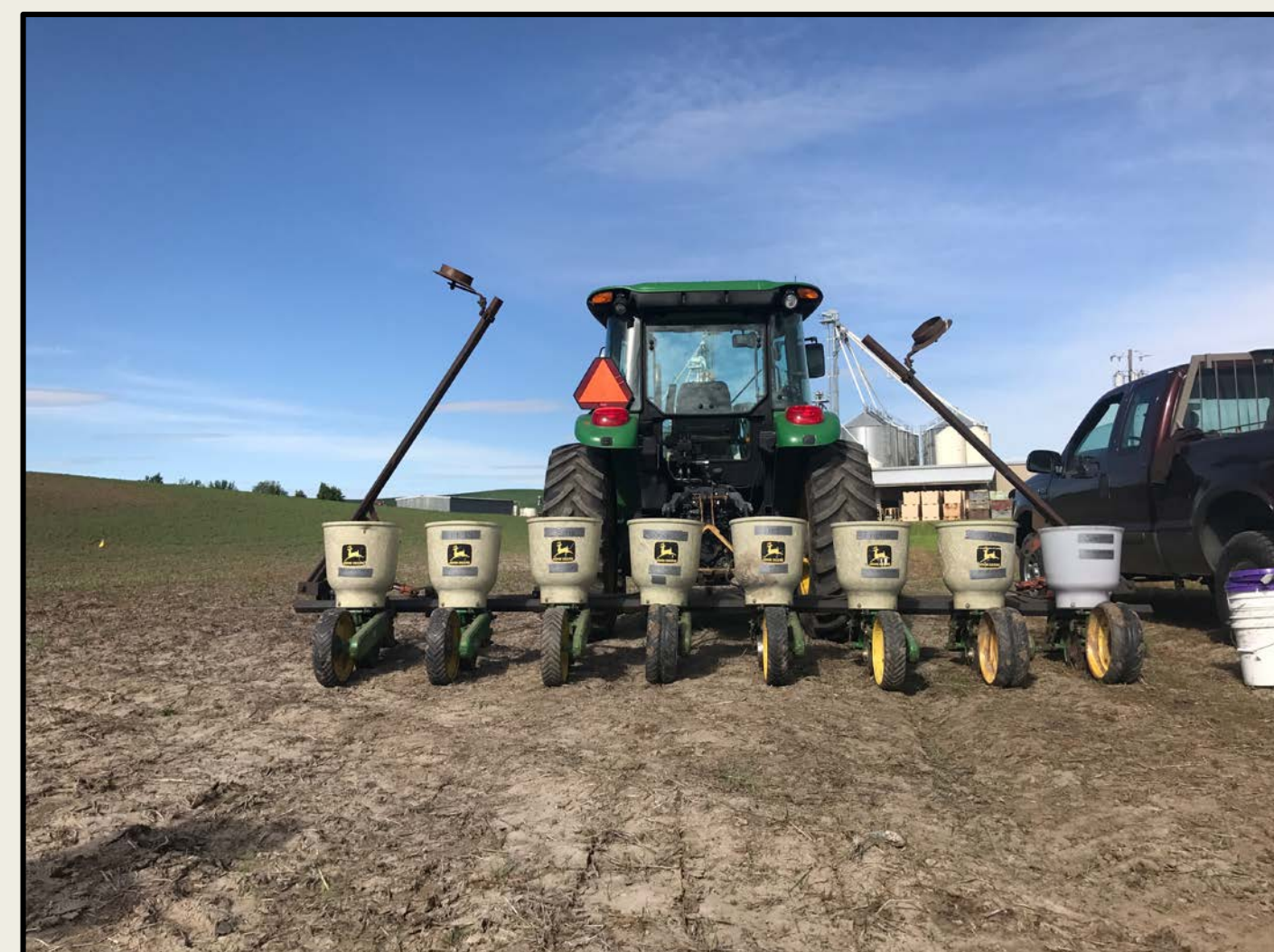
The tractor and planter used for test plot research. Each bucket is filled with a different seed variety. In each plot the variety's were treated with different chemical applications.

Hinrichs Trading Company is an international distributor and exporter for garbanzo beans. The company also works in the seed industry providing seed for farmer all over the nation. This operation is also involved in the processing of chick peas (garbanzo beans). This is a family owned operation that has been run by five generations of Hinrichs family members. The headquarters of this operation is located in Pullman WA. Hinrichs Trading Company goes above and beyond to ensure quality products. Their operation offers services such as transparent traceability of all bean functions and locations. They also provide growers with an equipped agronomy department to answer questions of concern.