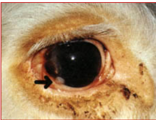
(Small epithelioma at arrow - cancer eye.)

Prevention of antemortem condemnations -- Several critical control points exist for to ensure that cows at risk for condemnation are not marketed for slaughter. These include areas of care, handling, and transport of cows at risk for becoming non-ambulatory cattle. Causes of non-ambulatory cattle include injuries, metabolic imbalances and infectious and toxic diseases. Risk factors for injury include slipping, lameness, rough handling and other animal contacts such as fighting or mounting. The focus should be on cattle management after assessment of the reasons for culling and suitability of each cow to enter the food supply. Management areas, including breeding programs, herd health, cow comfort, sanitation and calving management should also be addressed.