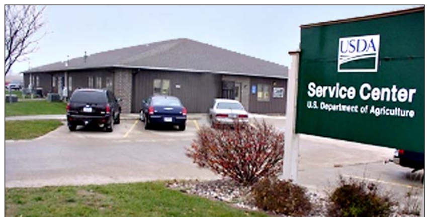
USDA Service Center.

Y ou may find it helpful to start by setting up an informational meeting with a loan officer to learn about the application process.