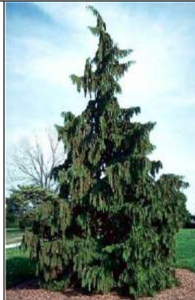
Weeping Alaskan Cedar

Sequoiadendrum sempervirans Size: 60' - 70' x 30' Zone: 5 Shape: Pyramidal Foliage: Blue green awl Shaped needles Flowers: Cone Fall color: NA Comments: Reddish brown bark