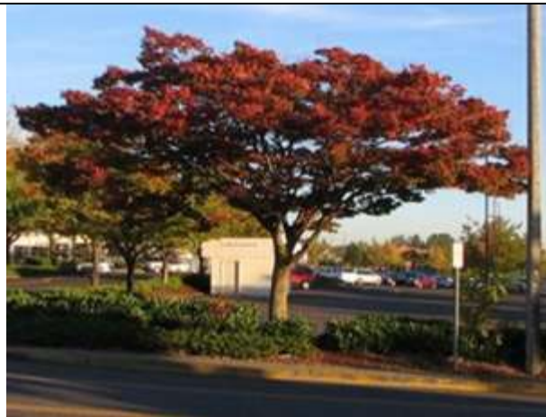
Zelkova Cultivar Forms

Maackia amurensis Size: 25' x 20' Zone: 3 Shape: Upright vase Shape with rounded crown Foliage: Medium green Flower: Upright white clusters in mid-summer Fall color: NA Comments: Tolerant of many conditions