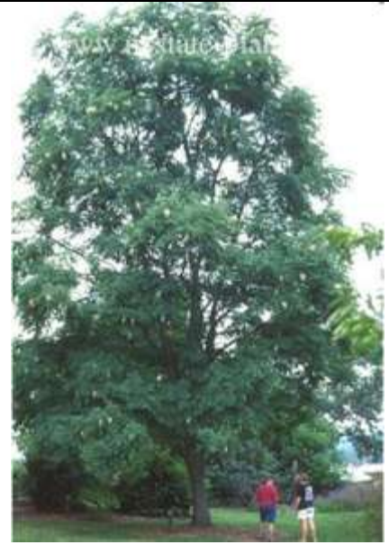
Kentucky Coffee Tree

Size: 50' - 60' x 25' Zone: 5 Shape: Pyramidal Foliage: Green blue, awl Shaped needles Flower: Cone Fall color: Bronze Comments: Smaller popular cultivars 'Yoshino' (15'-25' x 10'-15')- as shown