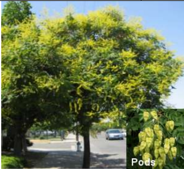
Golden Rain Tree

Gymnocladus dioica Size: 50' x 35' Zone: 4 Shape: Narrow to oval Foliage: Dark green Flower: White pea-like in late spring, pods Fall color: Yellow Comments: tolerates heat, drought, alkaline soils, and soil compaction.