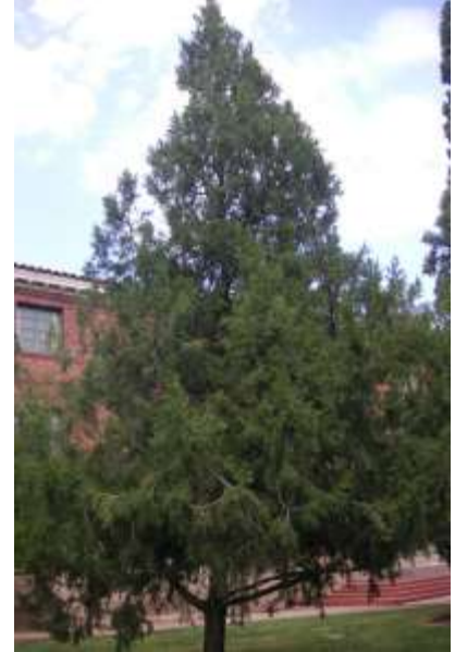
Eastern Red Cedar

Abies Concolor Size: 50' - 75' x 25' Zone: 3 Shape: Pyramidal Foliage: Blue needles Flower: Cones Fall color: NA Comments: cultivar 'Candicans'