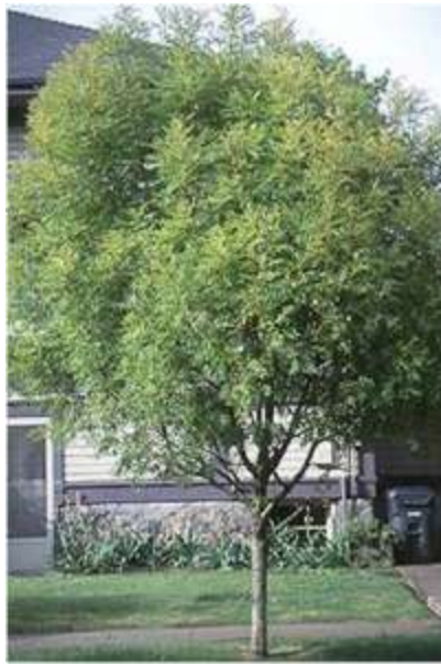
Golden Desert Ash

Pinus cembra 'Silver Whisper' Size: 12' x 6' Zone: 3 Shape: Columnar Foliage: Green 5 needle Flower: Cone Comments: Slow growing