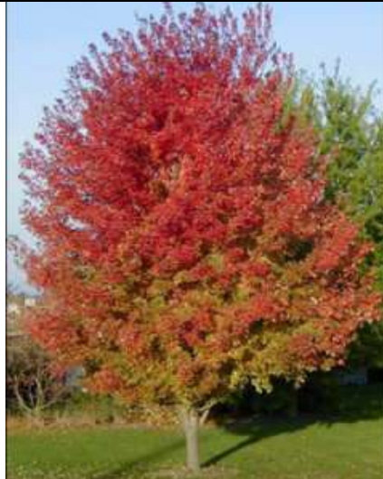
Autumn Blaze Maple

Cercidiphyllum japonicum Size: 40' x 40' Zone: 5 Shape: Upright, pyramidal when young, rounded with age Foliage: blue green Flower: NA Fall color: yellow to apricot Comments: Thin bark can sunburn. Compacted soil can be a problem.