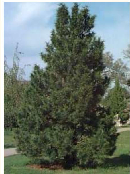
Japanese Umbrella Pine

Pinus flexilis 'Vanderwolf's Pyramid' Size 25' x 15' Zone: 4 Shape: Upright columnar Foliage: Blue green 5 needle Flower: Cone Comments: Very adaptable