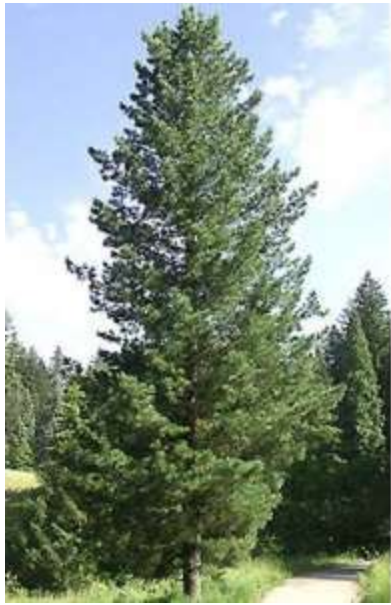
Silver Whisper Swiss Stone Pine

Pinus cembra 'Silver Whisper' Size: 12' x 6' Zone: 3 Shape: Columnar Foliage: Green 5 needle Flower: Cone Comments: Slow growing