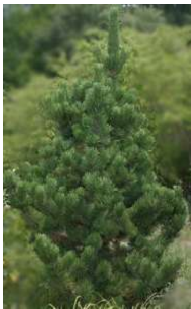
Oregon Green Austrian Pine

Pinus nigra 'Compacta' Size: 15' x 10' Zone: 4 Shape: Columnar to oval with upsweeping branches Foliage: Stiff dense 2 needle Flower: Cones