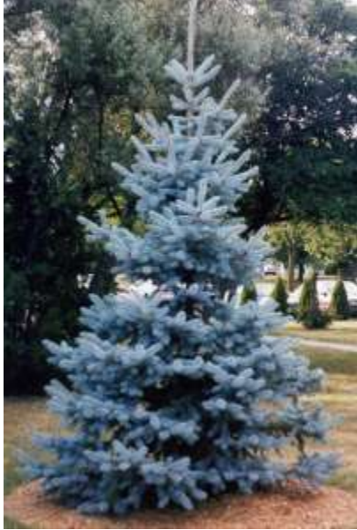
Colorado Blue Spruce

Picea pungens 'Hoopsii' Size: 30' - 60' x 10' - 20' Zone: 3 Shape: Pyramidal Foliage: Blue/green needle Flower: Cone Fall color: NA Comments: Smaller cultivar - Fat Albert (15')