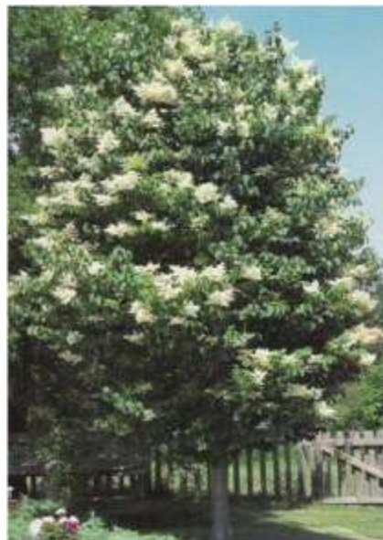
Japanese Ivory Silk Lilac

Stewartia pseudocamellia Size: 20'-30' x 20'-30' Zone: 5 Shape: Pyramidal to oval Foliage: Green Foliage: 2.5" white Fall color: Yellow/red/purple Comments: Attractive exfoliating bark, avoid hot afternoon sites .