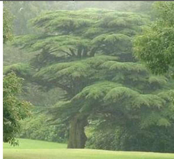
Cedar of Lebanon

Koelreuteria paniculata Size: 35' x 30' Zone: 5 Shape: Rounded Foliage: Dark green Flower: Yellow in summer, pods Fall color: Yellow/orange Comments: Tolerates drought, heat, wind, and air pollution