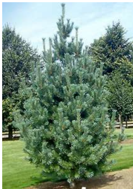
Vanderwolf's Pyramid Pine

Pinus nigra 'Compacta' Size: 15' x 10' Zone: 4 Shape: Columnar to oval with upsweeping branches Foliage: Stiff dense 2 needle Flower: Cones