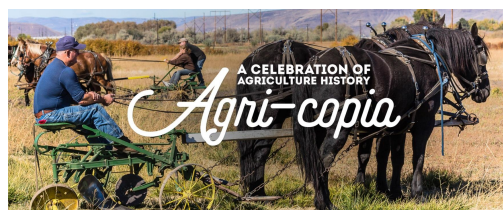
Agri-copia October 15-16, 2022

Get Ready! You'll want to be a part of the 7th Annual AGRI-COPIA celebrating the rich agricultural history of Central Washington! This is an agricultural event that is family friendly, educational and free admission. Make & enjoy S'mores kits for kids Saturday from 10-2 . Exhibition of the horses, Gentle Giants Horse Drawn Wagon Rides, Old time Horse Driven Plowing Bee. Come drive a vintage tractor! A REAL Mini Excavator for the kids to operate "Draft Horse Q&A Pumpkin Decorating for Kids on Saturday! Saturday Schedule Differs from Sunday, please see link for schedule.