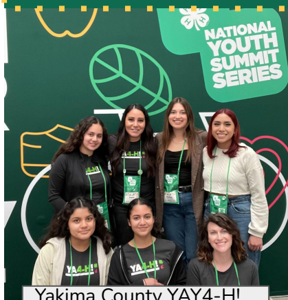
Yakima County YAY4-H!