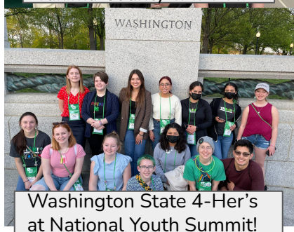
Washington State 4-Her's at National Youth Summit!