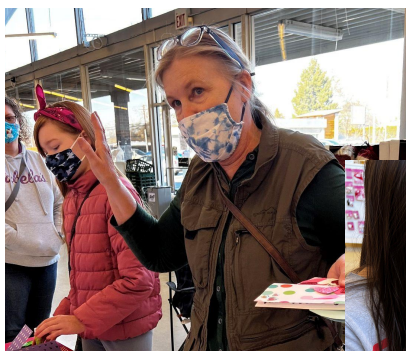
4-H'ers making cards and paper heart baskets!