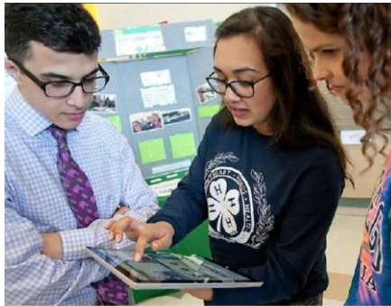
4-H TECH CHANGEMAKERS

Quincy, WA: recruiting participants for their technology class