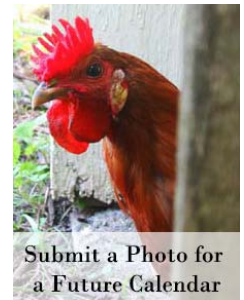
Submit a Photo for a Future Calendar

5. All photos will be credited with the person's name and state. Please submit appropriate images only. Inappropriate entries will not be considered.