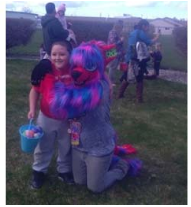
Ghost Gamers completed their community service by helping with the Quincy Hospital Egg Hunt. They helped hide eggs and set out snacks for the kids.