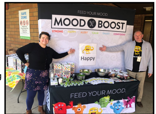
SNAP-Ed and EPS Nutrition Service staff

Before school ended the SNAP-Ed program partnered with the Evergreen School District Nutrition Services to provide a harvest tasting of local snap peas to all of Sunset Elementary school students and families. They also received a planting packet that gave kids an opportunity to plant and grow their very own pea plant at home.