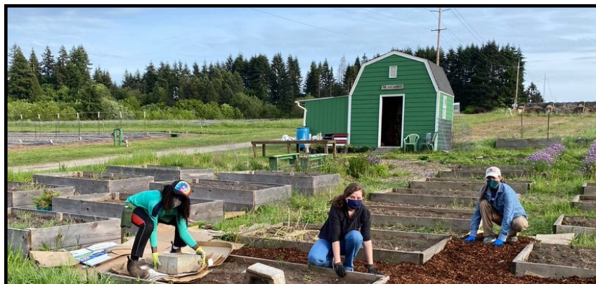
4-H Garden Club at Heritage Farm

The 4-H Restorative Community Service Garden at the Heritage Farm is utilized by the Sow, Bud, and Blossom 4-H club this spring to engage in hands-on learning experiences. The 4-H club has explored plant science and gardening topics, along with contributing to the maintenance and general care of the garden space.