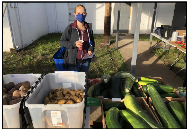
Extension staff supporting LULAC's Mercado Fresco event