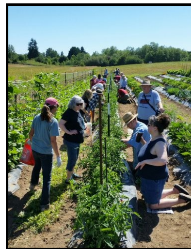
Tomato Pruning Workshop at Heritage Farm

Ninety-three people were in attendance for the hands-on workshops at the Heritage Farm. After an introduction which included details on why pruning is important and tips on how to determine which types of tomatoes require pruning and which do not, attendees broke into small groups to try their hand at some actual pruning under the guidance of trained Master Gardeners.