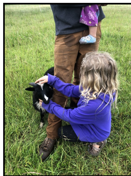
Haggerty Family-Dilish Farm

Partner organizations introduced their programs at the beginning of each workshop, including from the Watershed Alliance, Clark Conservation District, Department of Ecology, and Clark County Food Systems Council.