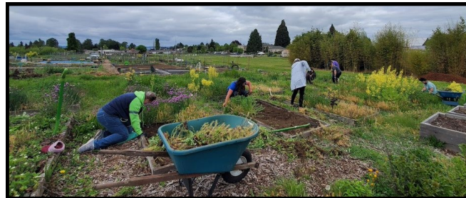
4-H and Cowlitz Tribe Participants at Heritage Farm

The Clark County 4-H program is partnering with the Cowlitz Indian Tribe Community Wellness Garden program to support community members in growing and distributing fresh, organic produce in the 4-H Restorative Community Service Garden at Heritage Farm. Four families are currently growing summer crops alongside participants in the Cowlitz Indian Tribe Substance Use Disorder program. The partnership with the Cowlitz Tribe will also allow for expanded educational opportunities in the garden with youth participants in the Clark County Juvenile Court Restorative Community Service program.