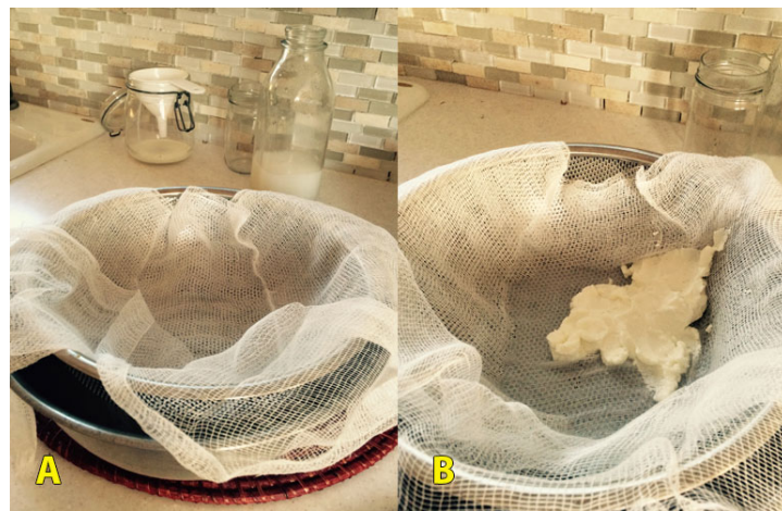
Figure 4. Steps for making yogurt cheese. A) Line a strainer with cheesecloth. B) The whey will separate from the yogurt, producing a cheese-like texture.

Nutritional value: 1 tablespoon = 1 gram protein, less than 1 gram fat, 30 mg calcium