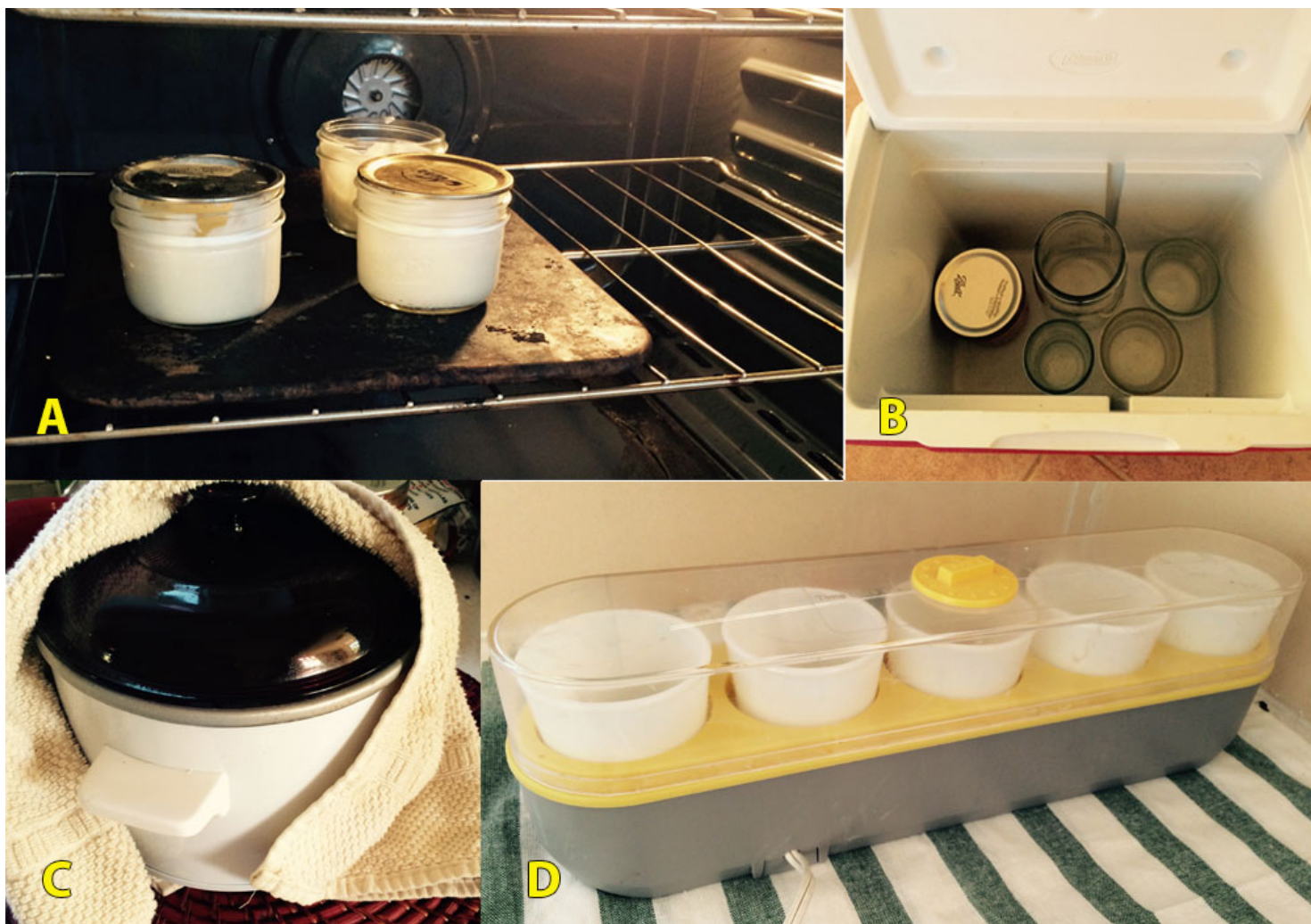
Figure 3. Yogurt incubation methods: A) Oven method. B) Insulated cooler. C) Crockpot. D) Commercial yogurt machine.

3. In a crockpot. The crockpot can be used to heat the milk, allowed to cool then add yogurt starter for fermentation. Wrap the crockpot in a towel and allow to set in a warm area.