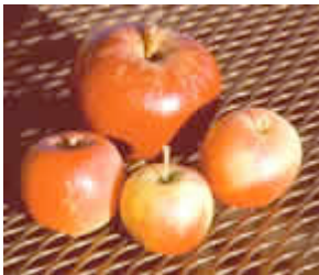
3 Wickson Crab Apples in front of Stayman Winesap

'Wickson' is a popular crab apple for hard cider. It does not need to be mixed with other apples to make an excellent cider. 'Wickson' tops the scale of sugar content with a Brix reading of at least 19.2°. [Brix is a measurement of soluble solids in the juice (mostly sugar) and represents the percentage of sugar in the juice.] Unlike most crab apples, this one is a large tree on seedling rootstock, so look for a semi-dwarf rootstock to control the size for easier maintenance and harvest. 'Wickson' is susceptible to scab, so a spray program is needed. Some do not consider 'Wickson' a crab apple since the fruit can exceed 2 inches in diameter. However, it is commonly thought of as a crab and is included here since it is popular for use in cider.