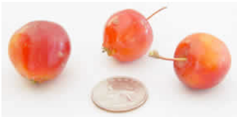
Evereste Crab Apples

'Dolgo' is commonly planted as it is an all-purpose crab apple. It can be eaten fresh, pickled, canned, or used for jelly, apple butter, or cider. The fruit is 1 ½ inches in diameter, more round than the 'Centennial,' and bright red. The prolific fruit ripens in early September and will quickly fall to the ground if not picked. The flower buds are pink, then open to white. The one drawback to 'Dolgo' is its scab susceptibility. In order to maintain a healthy tree and fruit quality, a regular spray program is required.