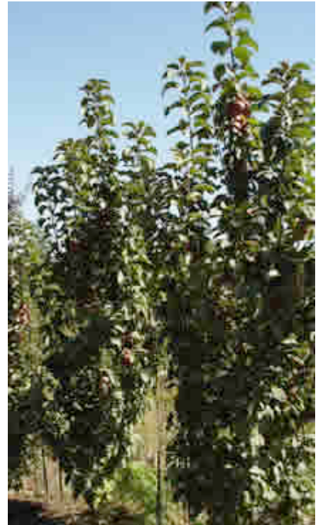
Maypole Crab Apple Trees

'Whitney' is an older, very popular cultivar that is good for fresh eating. The red, yellow-striped fruit is crisp, juicy, and mildly subacid. The tree has an upright shape, is very productive, and bears young. The flowers are white. 'Whitney' is susceptible to scab; therefore, a scab spray program is required for a usable harvest.