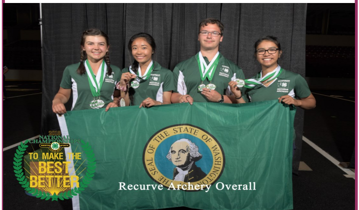
Washington State Recurve Archery Team Earned 1st Place at Nationals.