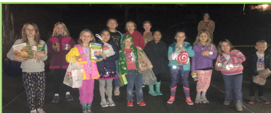
The 12 Bobbins 4-H Sewing Club collected non-perishable food items for Santa to pick up for the Central Kitsap Food Bank during his Santa Run through the Ridgetop neighborhood.