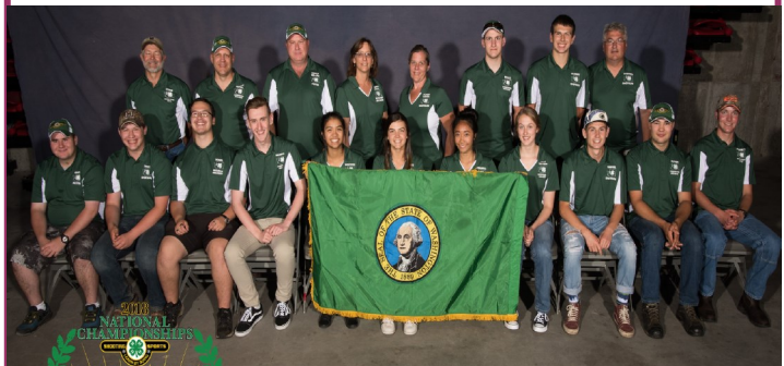
Youth representing Washington at the 4-H National Shooting Sports tournament.