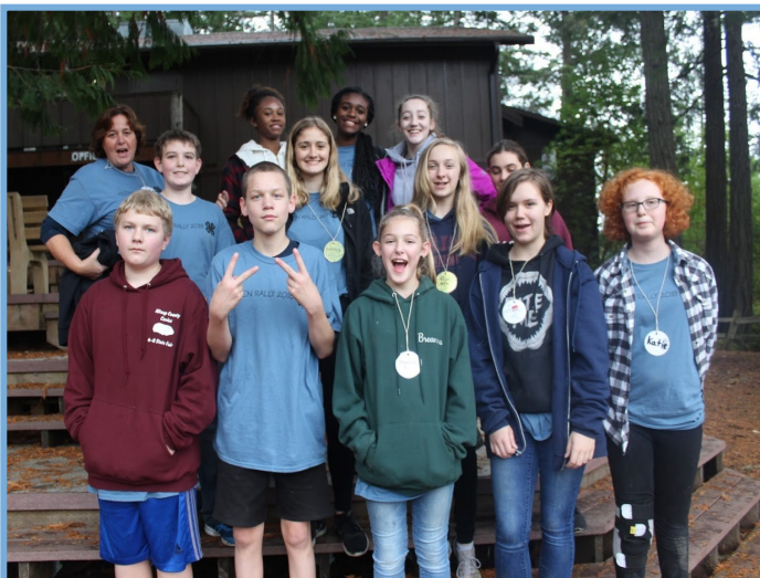
Kitsap County Youth at Teen Rally 2018!