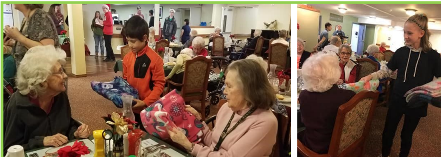
The Dusty Boots 4-H Club visited the residents of Brookdale Montclair Park and presented them with warm blankets for this winter.