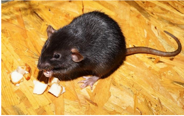
Top Left: The black rat is also known as the roof rat. Bottom Left: The Norway rat.