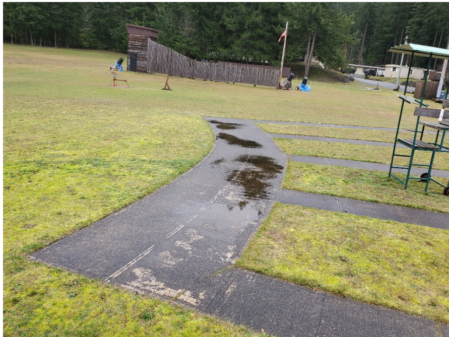
Upper Nisqually Trap Range #1 (Range #2 is beyond wall in background)

A 4-H staff person or their designee will be assigned to monitor from a distance that Covid mitigation practices are being adhered to. They will monitor both the shooting lines, youth, volunteers, and observers. They will gently remind violators of their violation and ask them to comply. Those who repeatedly do not comply will be subject to the 4-H disciplinary process.