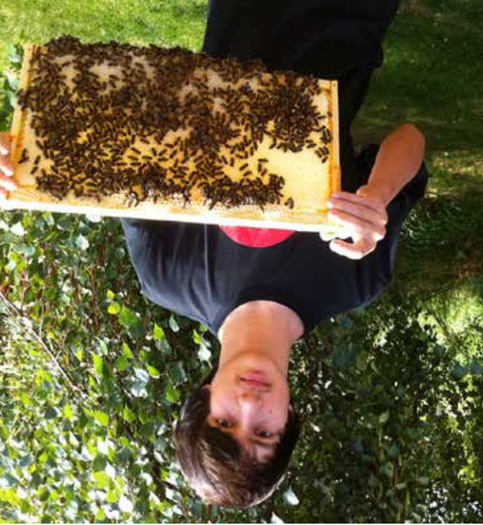
Brochure layout and design: Daria Lacy