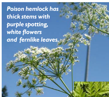
Poison hemlock has thick stems with purple spotting, white flowers and fernlike leaves.

http://ext100.wsu.edu/island/nrs/noxious/