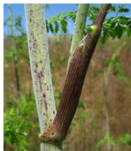
All parts of this plant (the roots, stems, flowers, seeds, leaves) are poisonous.