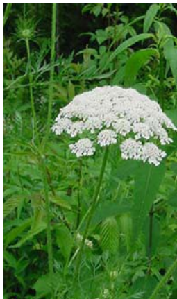
Don't be fooled: Wild carrot (sometimes called Queen Anne's Lace) is often confused with poison hemlock.