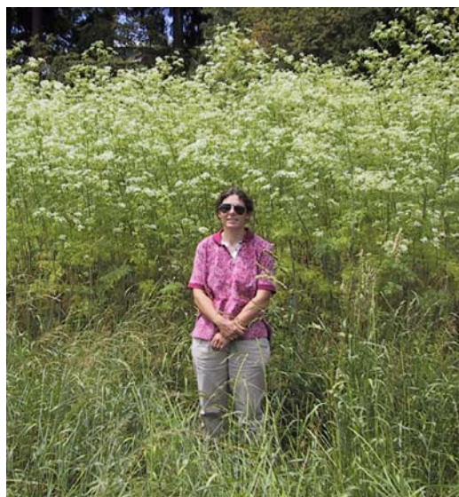
Poison hemlock quickly invades open areas, displacing beneficial plants.