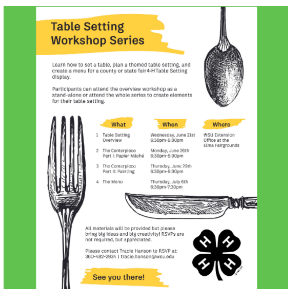
TABLE SETTING WORKSHOP SERIES – June 21 through July 6 - RSVP by June 14

WHY JOIN US? Meet camp counselors and staff members before camp, learn about some of the fun we have planned for you this year, answer any questions you have, and you may even see some familiar faces and reconnect with fellow campers from last year!