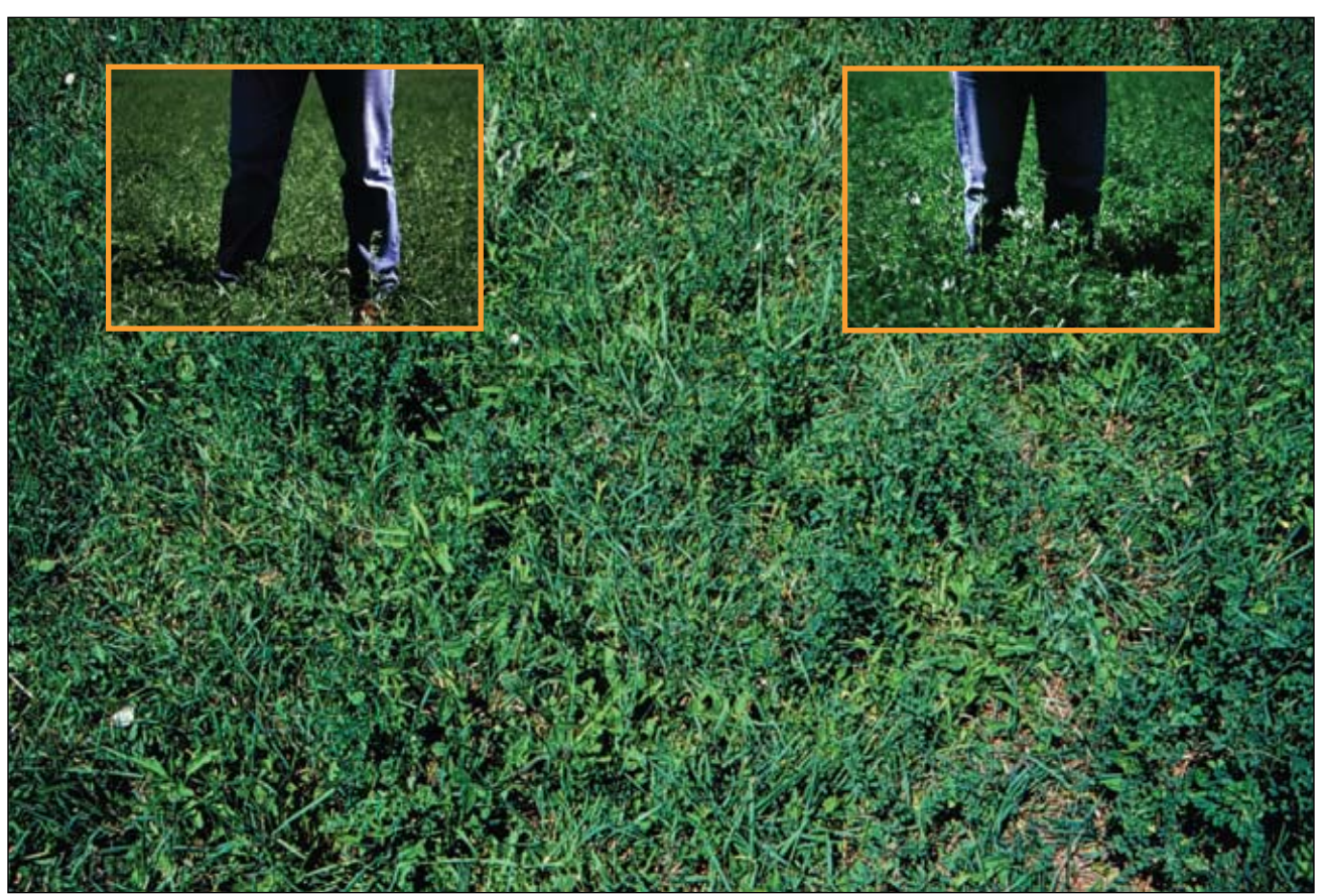
Figure 1. Symptoms of phosphorus deficiency in alfalfa include short plants, thin and weedy stands, and small, dark, or blue-green leaves. The overview photo is of a severely phosphorus-deficient stand of alfalfa. The left insert photo is of a phosphorus-deficient stand, while the right insert photo is of a phosphorus-fertilized stand.