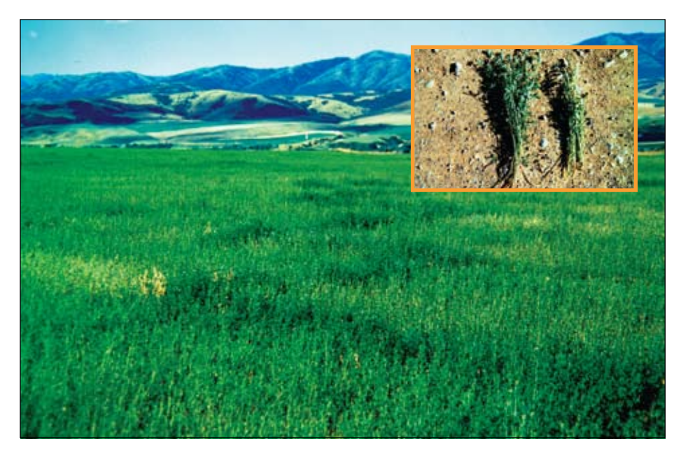
Figure 3. Symptoms of sulfur deficiency in alfalfa include short plants, thin stands, and light green color. The main photo shows a sulfur Z-strip applied to a sulfur-deficient field of alfalfa. The inset photo illustrates alfalfa that is sulfur-deficient (right) and sulfur-fertilized (left).

deficiency in sulfur for alfalfa results in reduced yield, crude protein content, and feed value.