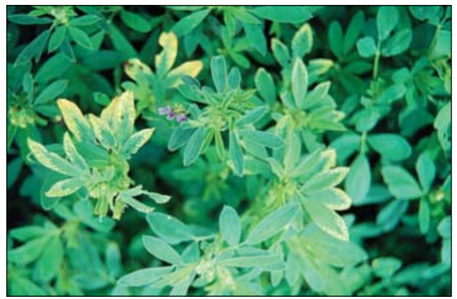
Figure 2. Potassium deficiency in alfalfa is represented by necrotic spots on the outer margins of young leaves and thin, declining stands.

After phosphorus, potassium is often the second most limiting nutrient in alfalfa production. Moderate potassium deficiencies can limit yields and reduce stand life. Visual symptoms (Figure 2) are easy to recognize but may not become apparent until deficiencies are severe enough to significantly reduce yield and shorten stand life.