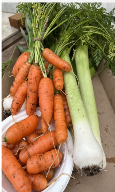
Carrots and leeks for the food bank.

Coming in November, we are planning our last workshop of the year on Holiday Plants and Forcing Bulbs. The Satsop Bulb Farm is donating bulbs for this event for the community to be able to learn this technique.