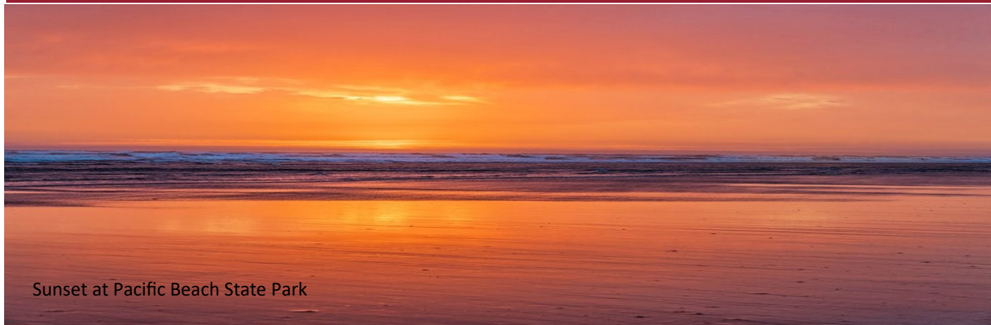
Sunset at Pacific Beach State Park

GRAYS HARBOR COUNTY EXTENSION SUMMER 2023