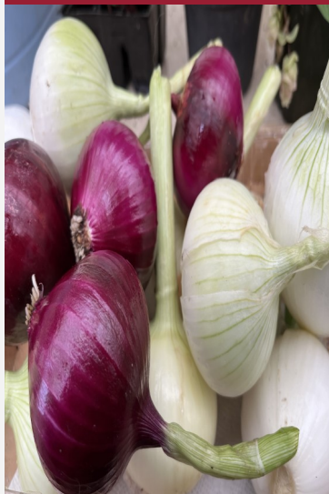
Beautiful onions from the Demo garden.