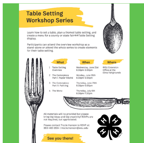
TABLE SETTING WORKSHOP SERIES – June 21 through July 6 - RSVP by June 14

Learn how to set a table, plan a themed table setting, and create a menu for a county or state fair 4-H Table Setting display. Participants can attend the overview workshop as a stand-alone or attend the whole series to create elements for their table setting. All sessions will be held at the WSU Extension office in Elma (34 Elma-McCleary Road). RSVPs are appreciated by Wednesday, June 14 at https://forms.office.com/r/mCxR97KLyy or call (360)482-2934