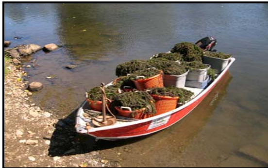
A boat full of Elodea -2005.

A base line map of the entire infestation was created in 2005 and will be used for monitoring and evaluation. The project was expanded in 2006 with the Chehalis Tribe adding a removal project to the efforts of 2005.