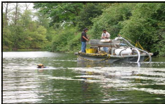
Chehalis Tribe removing Elodea.