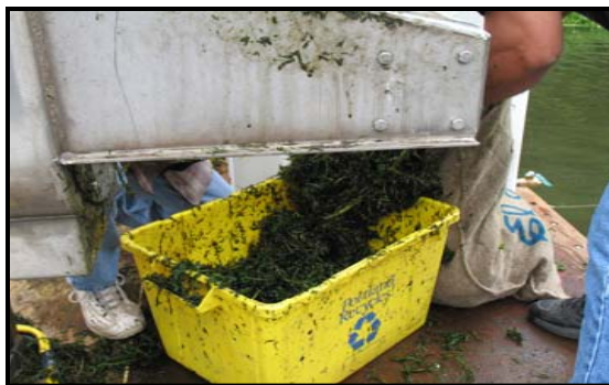
Water being separated from Elodea.