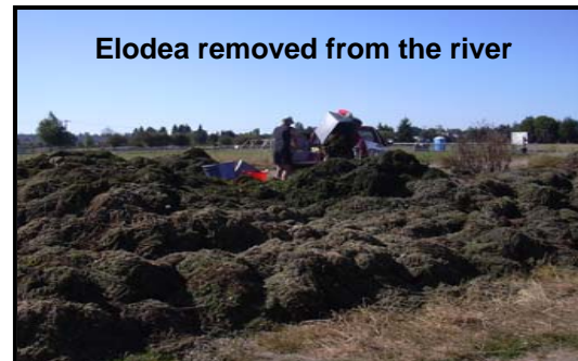
Elodea removed from the river