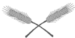
Asotin County Wheat Growers