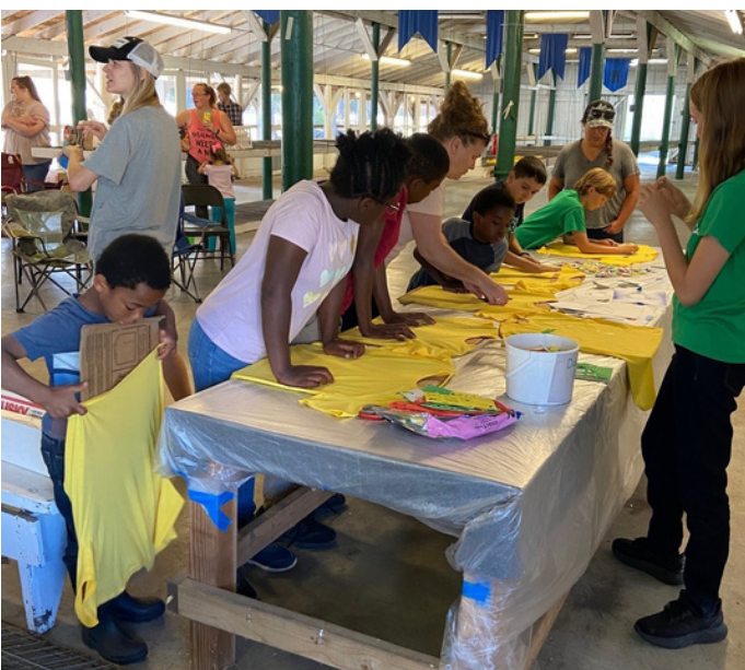
4-H Poultry Project members attend a pre-fair clinic.