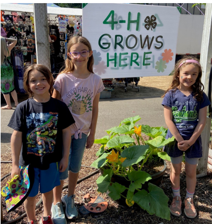
4-H members and the 4-H Garden at the fairgrounds. The Thurston County Fair Board selected the 4-H Garden to receive the 2023 special Fair Board award.