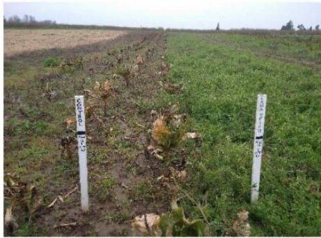
Interseeded cover crop (right) compared to no cover crop (left)

This workshop will feature seeding equipment, calibration demonstrations, interseeding, reduced tillage, and lively discussions with a panel of experienced farmers. Learn more about selecting and establishing cover crops in vegetable rotations.