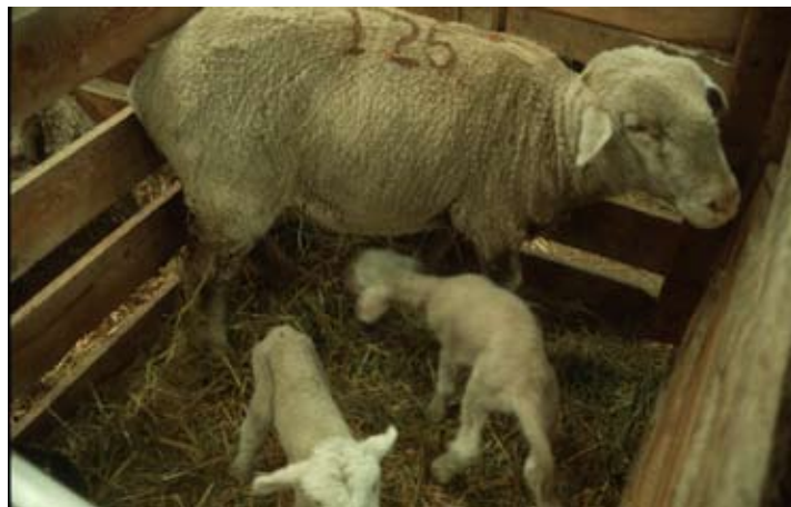
Table 1. Recommended factors for adjusting weaning weight.*

The lamb is a twin wether from a 4-year-old ewe and is being raised as a twin. Multiply 75.5 lb by 1.08, for an adjusted weaning weight of 81.5 lb.