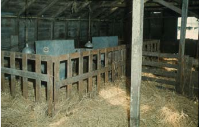
A creep feeding area set-up.