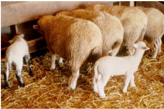
Table 2. Suggested daily rations for ewes (late pregnancy).

Determine how long a breeding season you want and remove the rams at the end of this time. A 34-day breeding season allows all ewes to return to heat if they don't conceive. Some have the opportunity to cycle three times. A longer breeding season tends to string out the lambing season, thus making management of lambs more difficult.